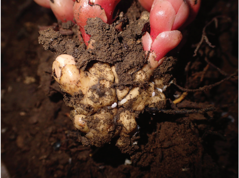
Figure 1. Live individuals of Formicoccus yoshinoi Tanaka, sp. nov. feeding on the underground part of the host plant, Balanophora fungosa .

rim ducts and oral collar tubular ducts absent on dorsum. Discoidal pores sparsely distributed on both body surface. Multilocular disc pores mostly present in medial area of ventral abdominal segments VI–IX. One size of oral collar tubular ducts present on venter, forming an irregular submarginal band on posterior abdominal segments and forming transverse rows on medial area of abdominal segments VI–IX.