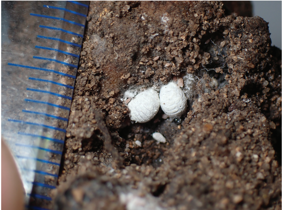
Figure 2. Live mature adult females of Formicoccus yoshinoi Tanaka, sp. nov.