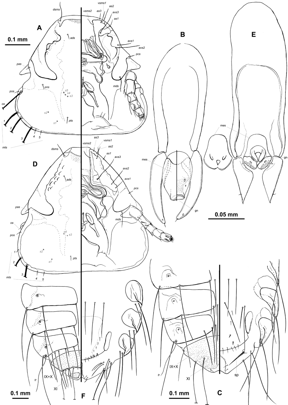
Figure 3. Bobdalgleshia stephanophallus : A male head in dorso-ventral views B male genitalia, mesosome in dorso-ventral views C female terminalia (VI–XI), in dorso-ventral views. Motmotnirmus marginellus D male head in dorso-ventral views E male genitalia, mesosome in ventral view, detail of mesosomal plate in dorsal view F female terminalia (VI–XI), in dorso-ventral views. Abbreviations: gn, gonopore; mes, mesosome; sp, spine-like seta of the gonapophyses; IX, X, XI, last three female abdominal tergites (9 th to 11 th ) [for other abbreviations, see methods].