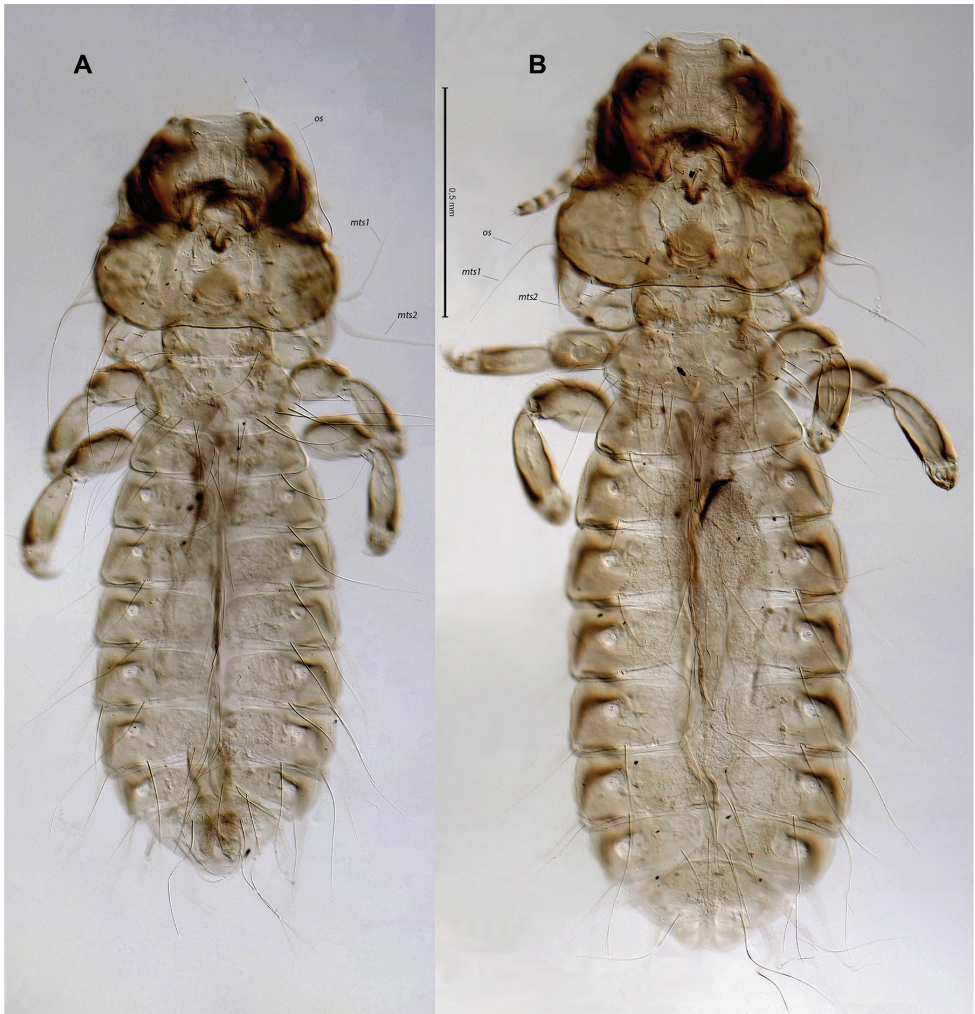
Figure 1. Bobdalgleishia stephanophallus , habitus in dorsal view: A male B female. Abbreviations: mts , marginal temporal setae 1 and 2; os , ocular seta.

M. humphreyi (Oniki & Emerson, 1982)) by the generic characters discussed above, i.e. head chaetotaxy (compare Figs 3A and 3D), male genitalia (compare Figs 3B and 3E), and female gonapophysis (compare Figs 3C and 3F). In addition, tergites VII–VIII in species of Motmotnirmus have more than four posterior tergal setae on each segment (Fig. 3F), in B. stephanophallus these same segments have fewer setae (males sometimes with 1+1 on VII only) (Fig. 3C).