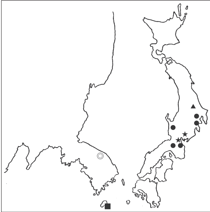
Figure 15. Distribution map of Typhlocolenis . Double circle: Typhlocolenis sillaensis sp. nov. Square: T. jejudoensis sp. nov. Circle: T. fusca Hoshina. Star: T. uenoi Hoshina. Triangle: T. furunoi Hoshina.

Scutellum weakly microreticulate and almost impunctate or sparsely and very minutely punctate.