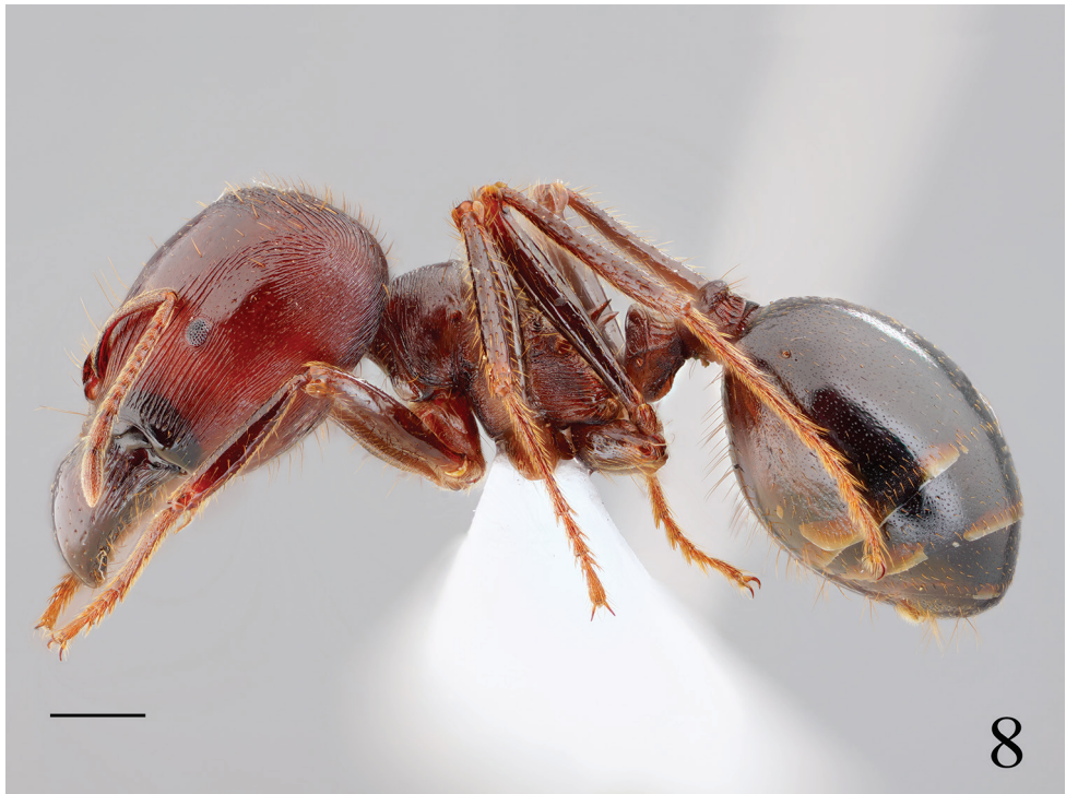
Figure 8. Lateral habitus of Carebara diversa . Scale bar: 1 mm.