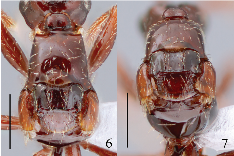
Figures 6, 7. Mesosoma of Rhadinoscelidia lixa sp. nov. (holotype) 6 dorsal 7 lateral. Scale bars: 0.5 mm.

(Fig. 4); lower gena with sparse suberect needle-like setae along occipital carina; scape with sparse decumbent needle-like setae and sparse suberect forked setae (Fig. 5); pedicel with dense decumbent needle-like setae; F with dense decumbent needle-like setae, shorter than each F length (Fig. 5).