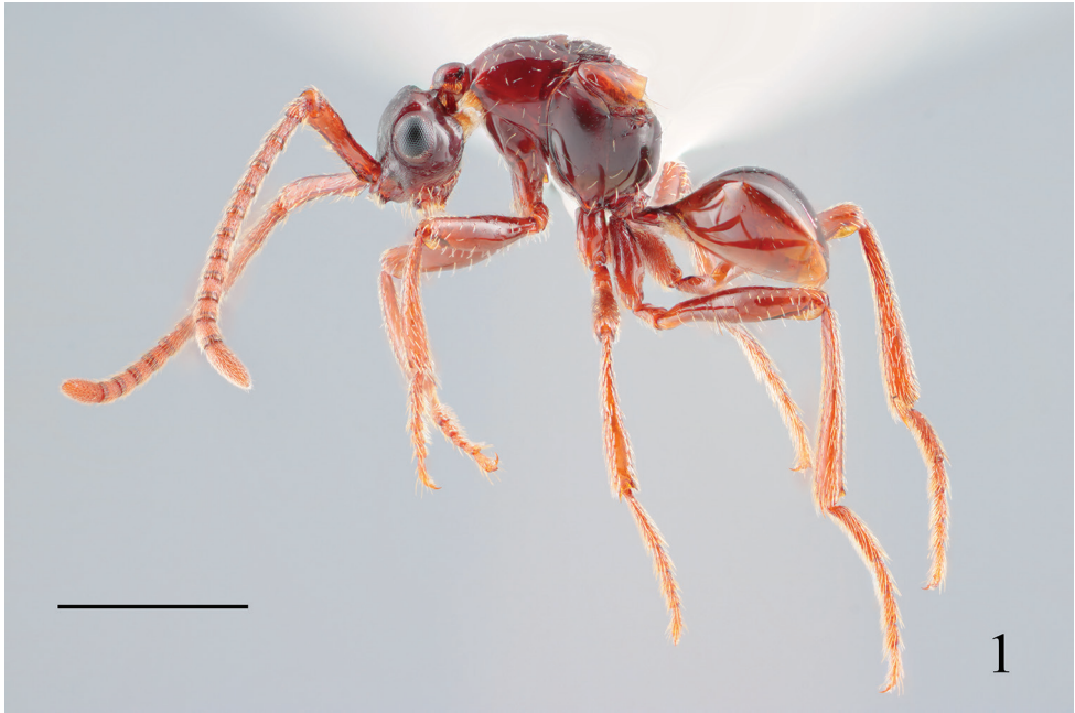
Figure 1. Lateral habitus of Rhadinoscielidia lixa sp. nov. (holotype). Scale bar: 1 mm.

Description of holotype. Female (Fig. 1). Body 3.0 mm long.