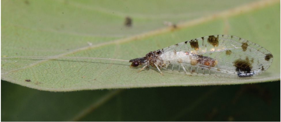
Figure 1. Chrysacanthia esbeniana Lacroix. Habitus, India.

(Adams 1967; Brooks and Barnard 1990; Adams and Penny 1992). The majority of the generic and species-level diversity in green lacewings is found in the subfamily Chrysopinae, which includes approximately 97% of all living species. This subfamily is additionally subdivided into four tribes: Belonopterygini Navás, Chrysopini Schneider, Leucochrysin Adams and Ankylopterygini Navás (Brooks and Barnard 1990; Winterton and de Freitas 2006). Belonopterygini (formerly Italo-chrysin Hölzel) represents one of the smallest of these tribes, with 14 genera distributed in all major biogeographic regions. Most individuals in this tribe are relatively large and robust chrysopids, frequently having dark yellow to brownish-tan colouration and dark markings on the body.