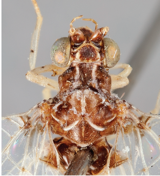
Figure 3. Chrysacanthia iwo sp. n. male head and thorax [abdomen dislodged during dissection].