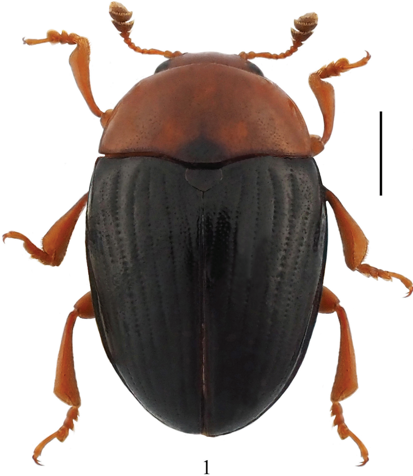
Figure 1. Dorsal habitus of Pseudamblyopus sinicus sp. nov. Scale bar: 1.00 mm.

weakly bisinuate, with border at both sides, but not along median antescular part. Anterior and posterior angles rounded, each with one pore. Prosternum (Fig. 8) almost impunctate laterally, with fine and sparse punctures medially, with golden setae; anterior border produced to short point in middle, with narrow and complete marginal border; prosternal process with subtriangular depression at apical emargination, surface with golden pubescence; prosternal lines extending anterior margin of procoxal cavities. Scutellar shield large, subpentagonal, transverse, with fine and dense punctures, subangulate posteriorly. Elytra with eight striae bearing distinct and rather coarse punctures.