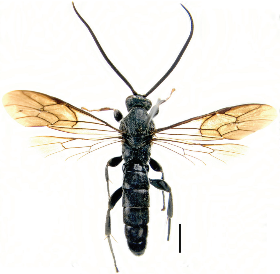
Figure 1. (Holotype) Habitus of Seticornuta koreana Lee & Choi, sp. n. Scale bar = 2.0 mm.

pleural carina lobed. Metapleuron glabrous, impunctate, its lower front ridge strongly projecting as a tooth above mid coxa. Fore wing with petiolate areolet, length of stalk as long as 2rs-m. Hind outer angle of second discoidal cell sharp. Fore wing vein cu-a curved (Fig. 3G). Hind wing with 11 distal hamuli. Nervellus inclivous, intercepted distinctly below middle. Legs very stout. Hind femur coarsely punctate, 2.5 times as long as wide. Ratio between lengths of hind tarsomeres 63:21:18:11:20. Spurs of mid tibia of equal length. Tarsomeres 2–4 of fore leg shorter than wide. Longer spur of hind tibia 0.5 times as long as basitarsus. Propodeum with very strong median longitudinal and apical transverse carinae (Fig. 3I). Combined basal area and area superomedia with parallel sides. Basal area separated from area superomedia by weak carina in some specimens (Fig. 3I). Costula absent. Lateral area punctate except in anterior inner part. Propodeal spiracle 3.0 times as long as wide, joining pleural carina.