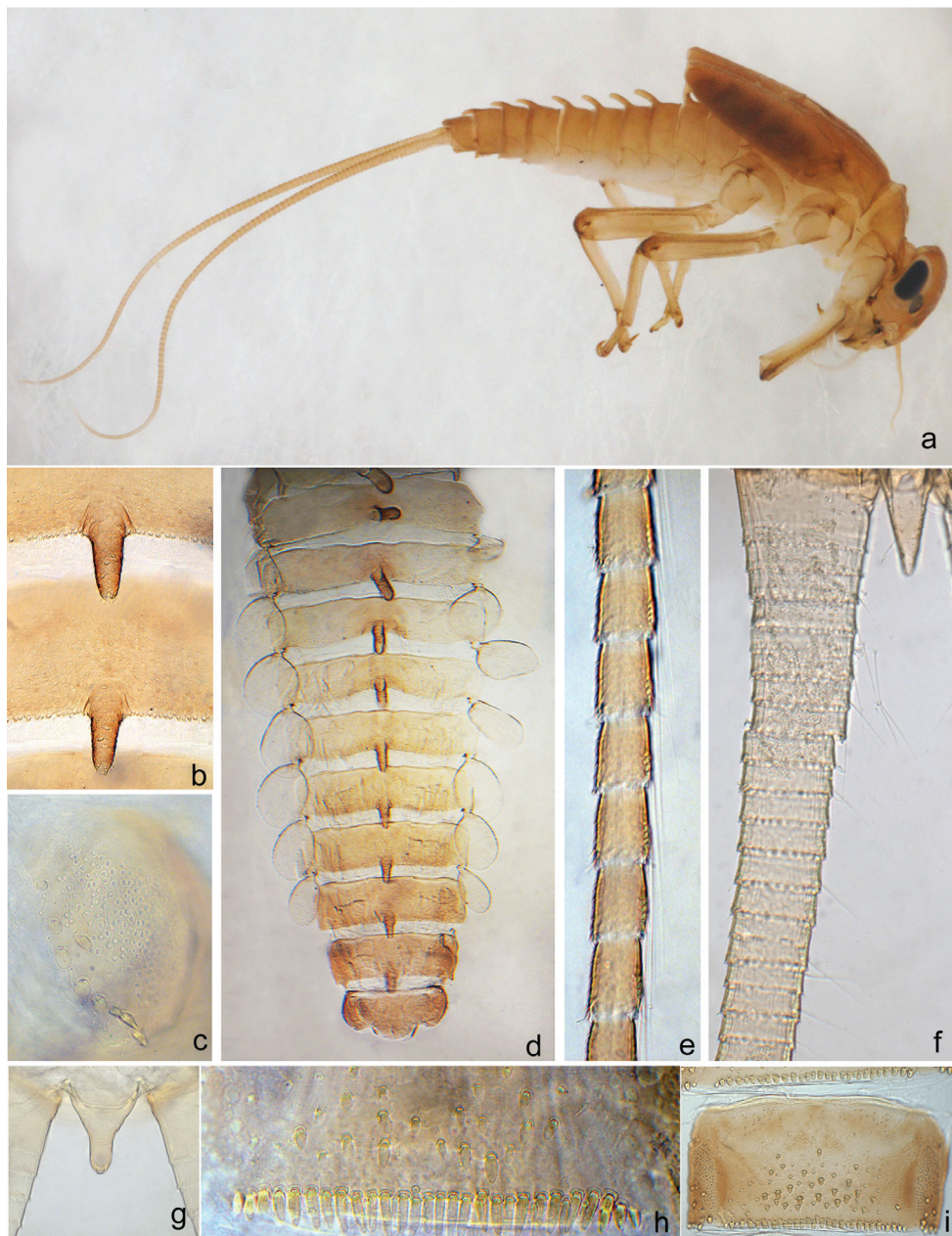
Figure 2. G. baibungensis sp. n. (a–e, g, h), G. narumona (f) and G. sororculaenadinae (i). a habitus of lateral view b protrusion on abdominal terga VI–VII c paraproct d abdominal terga I–X e inner marginal bristles on cerci f inner marginal bristles on cerci g terminal filament h posterior margin of abdominal sterna VIII i sterna VII–VIII.

and approximately one third of tergum length on segment IX; surface of protuberance scattered with scale-like setae (Fig. 2b). Terga surface with scattered scale-like and fine setae, posterior margin with blunt denticles. Surface of sterna scattered with round