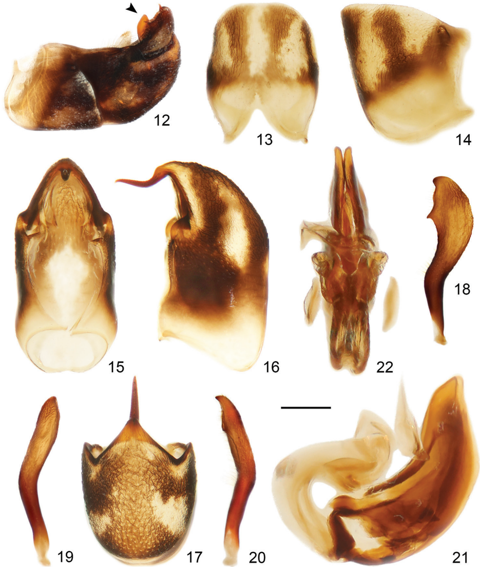
Figures 12–22. Hornylia obtusipetala sp. nov., male 12 abdominal segment VIII and genitalia, the arrow points to the apex of phallus 13, 14 abdominal segment VIII 15–17 pygophore 18–20 paramere 21, 22 phallus 12, 14, 16, 18, 21 lateral view 13, 15, 20, 22 dorsal view 17 caudal view 19 ventral view. Scale bars: 0.25 mm ( 12 ); 0.375 mm ( 13–19 ); 0.50 mm ( 20–21 ).