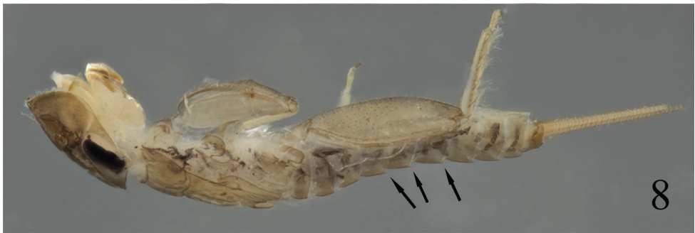
Figures 7–8. Epeorella vadora (Webb & McCafferty, 2007), comb. n. 7 Nymph paratype in dorsal view 8 Nymph paratype in lateral view with median abdominal ridge (arrows).

of Epeorella , and is considered as a subjective junior synonym of Epeorella syn. n. The species Epeorella vadora comb. n. is retained as a valid species because it exhibits a different colour pattern of the abdomen.