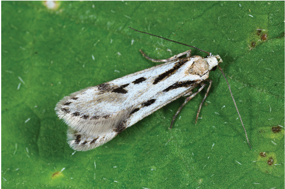
Figure 1. Alpine species of Sattleria are a striking example of long underestimated species diversity.