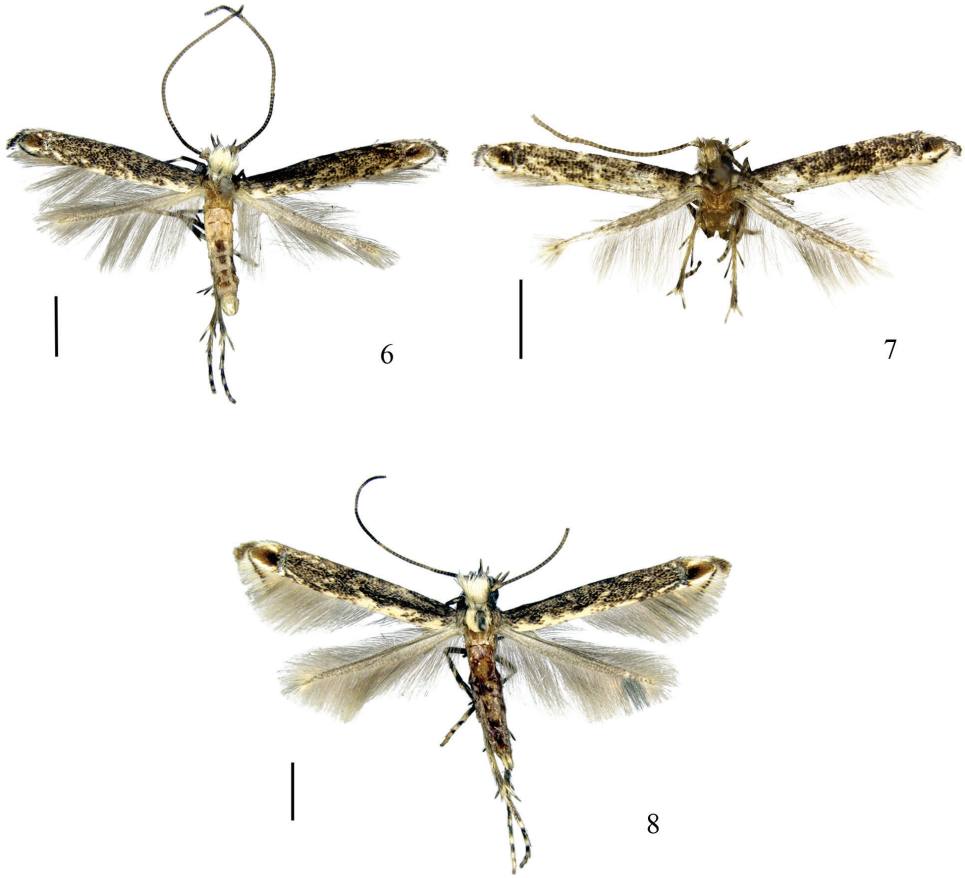
Figures 6–8. Adults of Epicephala spp. 6 E. microcarpa sp. n., paratype ♂ 7 E. laeviclada sp. n., holotype ♂ 8 E. tertiaria sp. n., paratype ♀ (Scale bars = 1.0 mm).

E. Meyrick det., in Meyrick Coll.; label 3: Meyrick Coll., B. M. 1938–390; label 4: B. M. Genitalia slide No. 32328, dissected by Houhun Li, deposited in the Natural History Museum, London (BMNH).