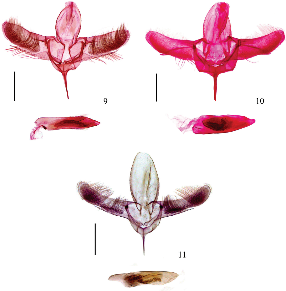
Figures 9–11. Male genitalia of Epicephala spp. 9 E. microcarpa sp. n., paratype, genitalia slide No. WZB14371 10 E. laeviclada sp. n., paratype, genitalia slide No. YXF14282 11 E. tertiaria sp. n., paratype, genitalia slide No. ZJ10021 (Scale bars = 0.2 mm).

Paratypes – CHINA: Guangxi Zhuang Autonomous Region: 9♂, 4♀, same locality and host-plant as holotype, 26.vii.2011, 26.iv–24.vi.2012, 27.iii–14.iv.2013 collected under light or reared from fruits of host-plant. Hainan Province: 1♀, Tropical Botanical Garden, Danzhou, 30.xi.2009, reared from fruits of Phyllanthus microcarpus (Benth.) by Bingbing Hu.