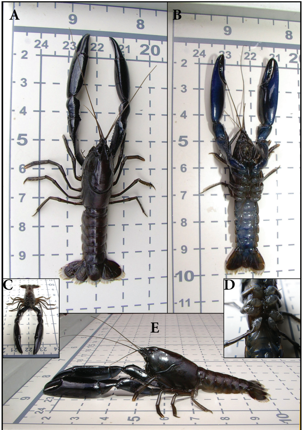
Figure 2. Gramastacus lacus sp. n. Holotype male, AM P.89665, 18.63 mm OCL, 5.07 grams. A dorsal view B ventral view C anterior view D male genital papilla E lateral view. All measurements in centimetres.