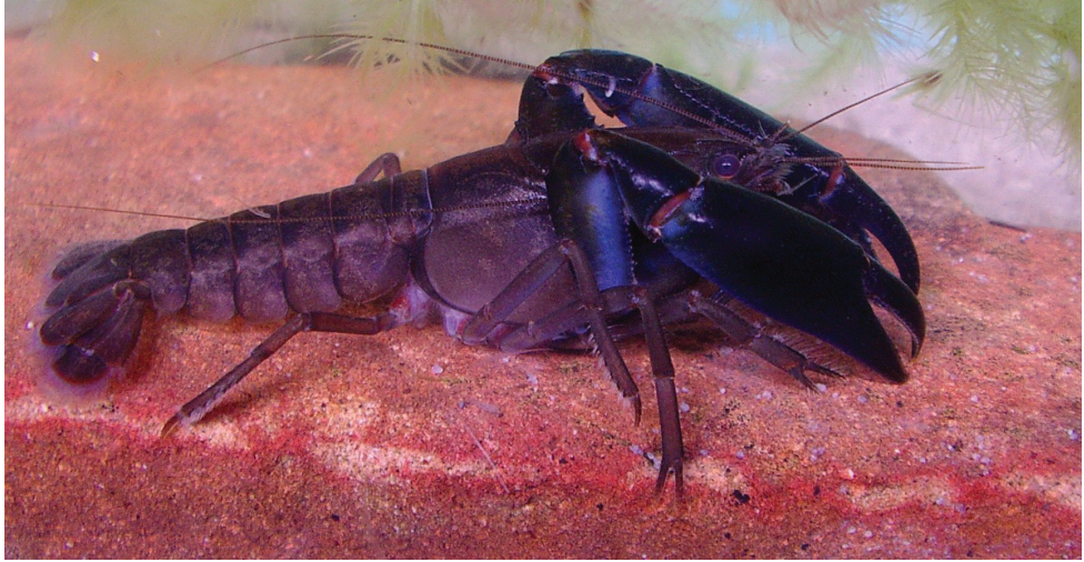
Figure 1. The eastern swamp crayfish Gramastacus lacus sp. n.