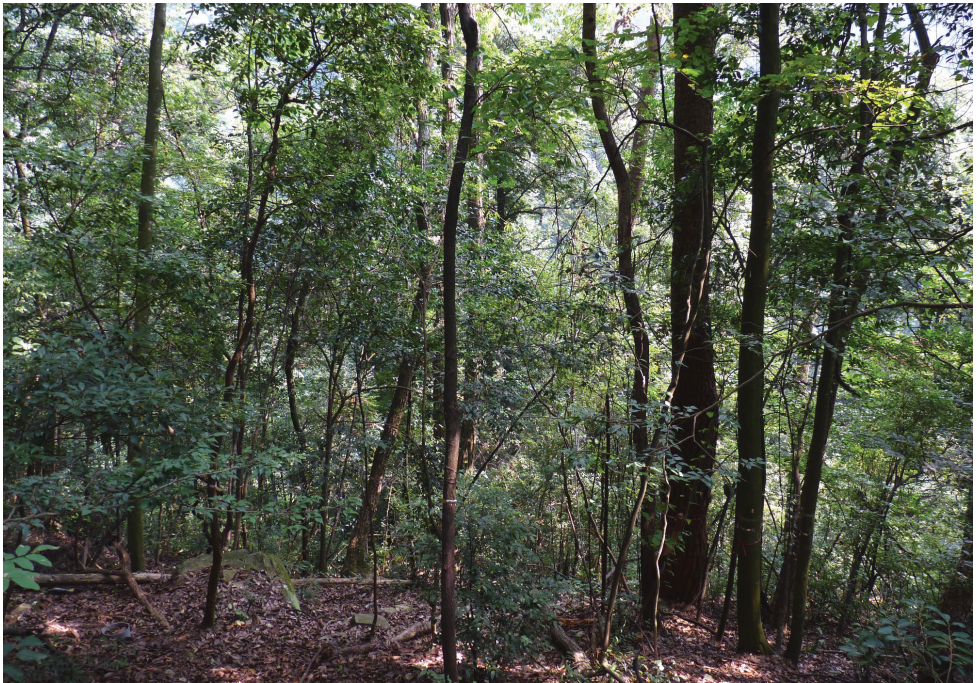
Figure 6. Typical mixed evergreen broad-leaved forest at the type locality, the Gutianshan National Nature Reserve.

on mesopleuron, metapleuron and lateral face of propodeum finer than on pronotum, appearing almost punctate in magnification lower 64\times . Entire petiole finely reticulate. Postpetiole finely reticulate, except the dorsum smooth and shiny. Gaster smooth and shiny. Coxae finely reticulate, femora densely punctate, tibiae sparsely punctate.