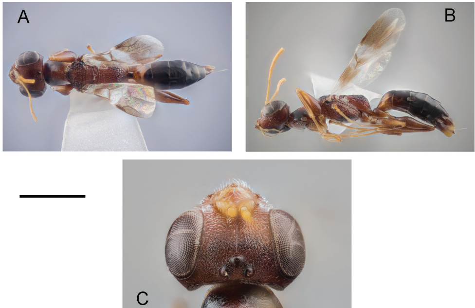
Figure 1. Dryinus georgianus sp. nov., female holotype: habitus in dorsal (A) and lateral (B) view; head in dorsal view (C). Scale bars: 1.28 mm (A, B); 0.46 mm (C).