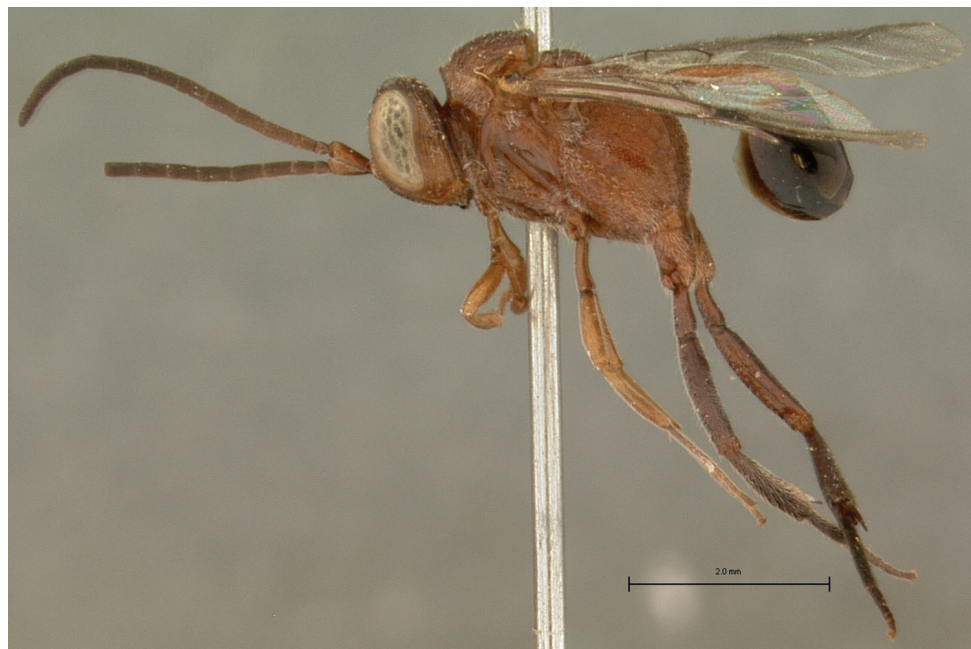
Figure 1. Evaniscus sulcigenis Roman, 1917. Lateral habitus (whole body) of holotype.