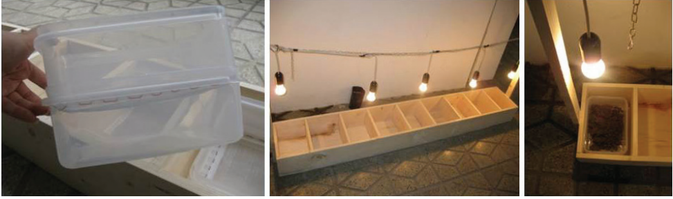
Figure 1. Extractor system for soil animals.

(Western Iran). The samples were placed in dark polythene bags. Collembola were extracted from soil and leaf litter by Berlese funnels (Figure 1). Animals were collected in water and separated under a dissecting microscope. The extracted specimens were preserved in 75% ethanol. Permanent microscopic slides were prepared using Hoyer medium; for immediate identification, a mixture of lactic acid and glycerin (5:1) was used. For observing detailed structures of specimens, a 100×oil immersion objective was used. The specimens were identified by taxonomic keys such as Gisin (1960), Fjellberg (1980, 1998, and 2007), Bretfeld (1999) and Potapov (2001). Identification of species was confirmed by Collembola experts such as Dr. Mikhail Potapov (Russia), Dr. Hans-Uergen Schulz (Germany), Dr. Ulrich Burkhart (Germany) and Dr. Louis Deharveng (France).