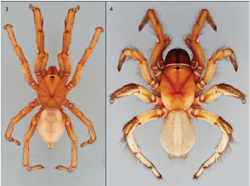
Figures 2–4. Habitus photograph and illustrations of Pionothele gobabeb sp. n. 2 Live male specimen 3 habitus digital illustration of male holotype specimen 4 habitus digital illustration of female.