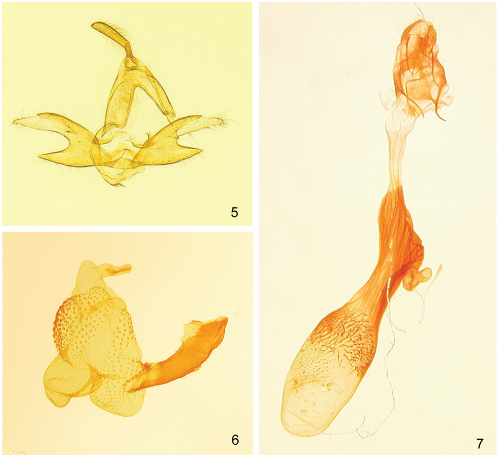
Figures 5–7. Zanclognatha dentata sp. n. genitalia. 5 male, NY: Hamilton Co., Indian Lake, McCabe diss. no. 1279. 6 aedeagus, same data. 7 female, NY: Franklin Co., Bloomingdale bog, McCabe diss. no. 4188.

adorned with a small tooth, which is only half as long as the width of the costal lobe, whereas Z. lituralis has a large tooth that is as long as the costal lobe is wide. Z. lituralis has a valve that resists spreading during genitalic preparation and becomes badly skewed if forced. Z. martha resembles Z. dentata but is larger. The spread valves of Z. martha expand to 3.0 mm whereas those of Z. dentata expand to 2.7 mm. Z. dentata male genitalia appear indistinguishable from those of Z. protumnusalis to our eye. Female genitalia have similar internal spinules in the corpus bursa in Z. dentata , Z. lituralis , Z. martha , and Z. protumnusalis , but these extend farther on one side of the bursa in Z. protumnusalis and Z. dentata . In our dissections, length of the female genitalia in Z. dentata is \geq 6 mm in total length, whereas those of Z. protumnusalis length measure circa 5 mm.