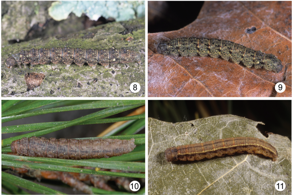
Figures 8–11. Last instar Zanclognatha . 8 Z. dentata sp. n.: NC: Haywood Co., Great Smoky Mountain National Park, Catalochee Campground, DLW Lot 2002E83, larva and photo 10 June 2002. 9 Z. dentata sp. n.: NJ: Atlantic Co., Egg Harbor Township, Abescon Creek, female (mother) 15 July 2002; photo: 24 August 2002, DLW Lot 2002G117 10 Z. martha . NY: Clinton Co., Clintonville, Dry Bridge Road, N44°28'14", W73°36'15", 660ft, larva 25 June, 2008, on Pinus rigida , DLW Lot 2008F200 11 Z. protumnusalis . CT: New London Co., Griswold, Hopeville Pond State Park, female 10 August, 1997, image November 1997, Fred Hohn lot number F263.

of June through early August, with more than 80% of the adults from New Jersey northward taken in July. Records from early September in western North Carolina and northern Georgia by James Adams (pers. comm.) are indicative of a small second brood, as also occurs in Z. protumnusalis and others (Wagner et al. 2011).