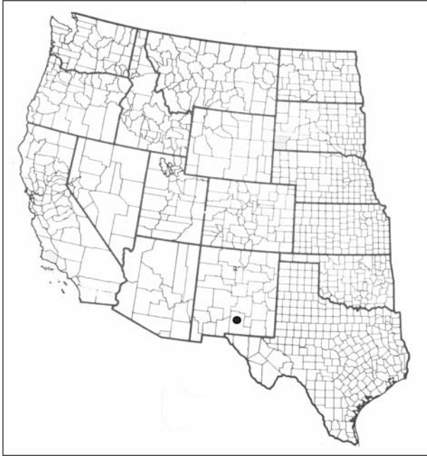
Figure 14. Distribution map for Schinia poguei .

reported twenty species of Lepidoptera from the Monument. In the period 9 February 2007 through 31 December 2010 Metzler and Forbes identified more than 430 species of Lepidoptera (unpublished data) from the Monument. A complete description of the study site and some of its unique biological resources is in Metzler et al. (2009).