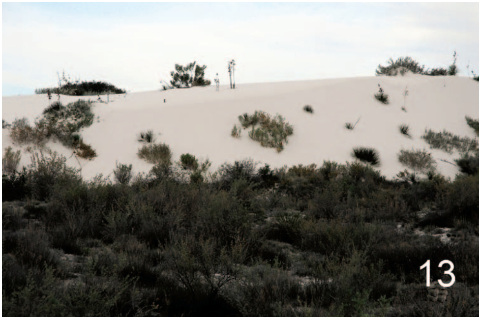
Figure 13. White dune habitat of type locality of Schinia poguei .

White Sands National Monument preserves 284.9 km 2 (110 square miles), or about 40%, of the world's largest snow-white gypsum dune field. The remainder of the 275 square miles dune field is under the jurisdiction of the U.S. Army in the White Sands Missile Range. The dune field is located in the northern Chihuahuan Desert in southern New Mexico's Tularosa Basin (Schneider-Hector 1993). In 1950 Stroud