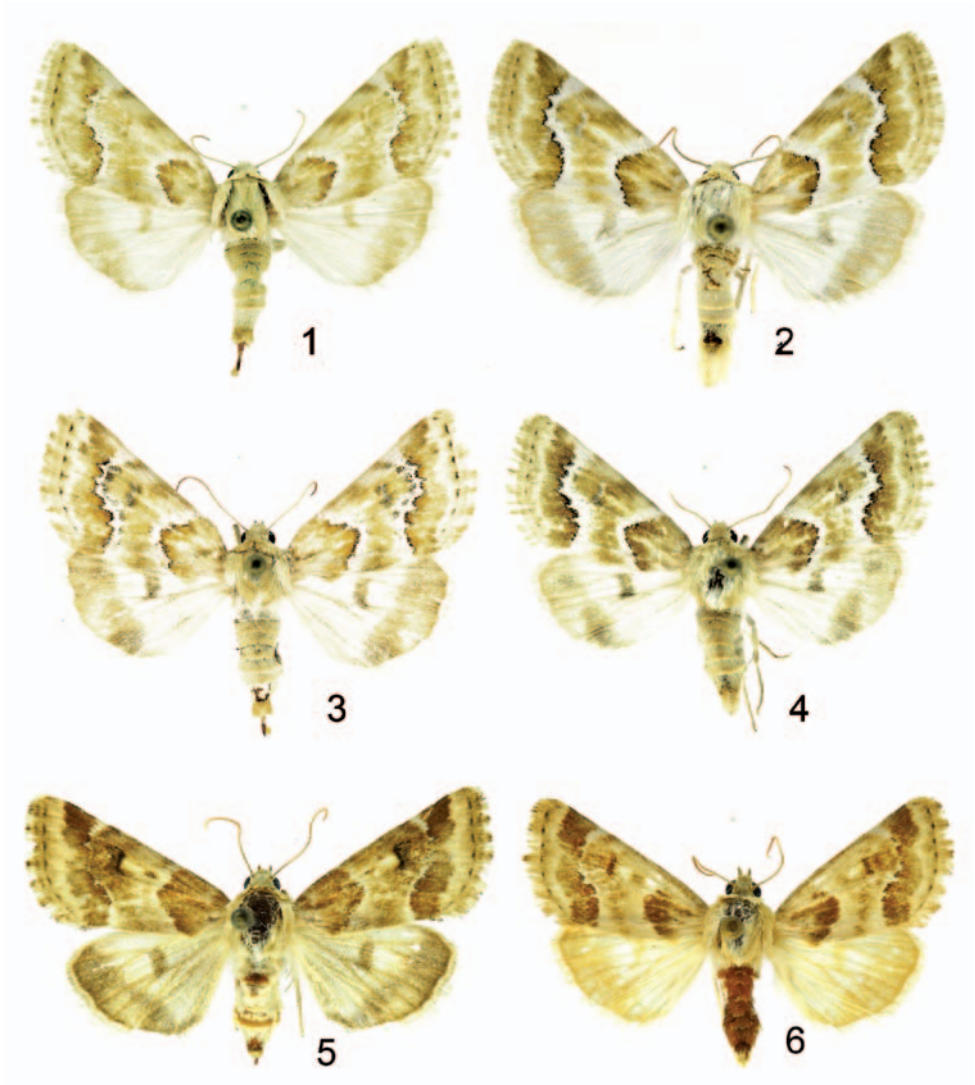
Figures 1–6. Schinia adults. 1 S. poguei Metzler & Forbes, female holotype 2 S. poguei Metzler & Forbes, male paratype 3 S. poguei Metzler & Forbes, female paratype 4 Schinia poguei Metzler & Forbes, male paratype 5 S. walsinghami Grote, female 6 S. walsinghami Grote, male.

4,008', 10 Oct[ober]. 2010, WsnmF, Eric H. Metzler, uv tr[a]p, Accss #: WHSA - 00131" "HOLOTYPE USNM Schinia poguei Metzler & Forbes" [red handwritten label] (USNM). Paratypes: 290 males and 107 females: NM: Otero Co. White Sands Nat[ional] Mon[ument] (hereafter WSNM) same data as Holotype. USA: NM: Otero Co. White Sands Nat[ional] Mon[ument], interdune habitat, 106°10.84'W, 32°46.64'N, 4,008', 4 Oct[ober]. 2010, WsnmF, Eric H. Metzler, uv tr[a]p, Accss #: WHSA - 00131 USA: NM: Otero Co. WSNM, interdune habitat, 106°11.49'W, 32°45.60'N, 4,000', 14 Sept[ember] 2009, WSNMB, Eric H. Metzler, uv tr[a]p, Ac-