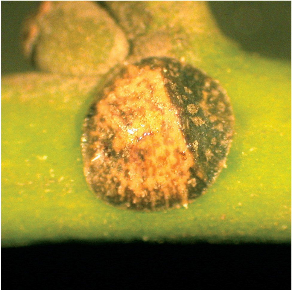
Figure 1. Pulvinaria citricola (Kuwana, 1909), a pre-oviposition adult female on Ilex integra .

3.5–7.0 mm wide, consisting of a compact group of 2–11 pores anterior to anal plates. Dorsal tubular ducts absent. Dorsal microductules frequent throughout. Dorsal tubercles absent. Anal plates posteriorly elongated; each plate with posterior margin about two times as long as anterior margin, each with 3 fine apical setae and a discal seta; length of plates 214–249 \mu\text{m} ; width of single plate 85–122 \mu\text{m} ; each plate with well-developed supporting bars. Ano-genital fold with 2 pairs of setae along anterior margin and 1 or 2 pairs laterally. Anal ring with 6–8 setae (mostly 8). Eyespot present near margin