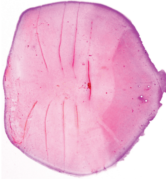
Figure 2. Photograph of a stained scale, collected from mid-body below the dorsal fin, of Sardinella pacifica sp. n. (BMNH 1985.4.12.1, 105.1 mm SL, Manila Bay, Luzon Island, Philippines).