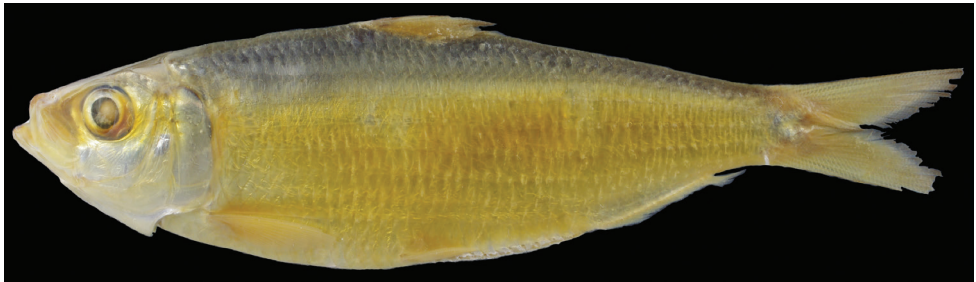
Figure 3. Lectotype of Sardinella fimbriata , MNHN 3227, 118.2 mm SL, Malabar, India.

sal-fin origin, more than 70 lower gill rakers on the first gill arch, eight pelvic-fin rays, 15–18 branched anal-fin rays, and 17 or 18 prepelvic scutes (Whitehead 1985, Munroe et al. 1999, Stern et al. 2016). However, S. pacifica can be distinguished from the latter by lower counts of lateral scales in the longitudinal series (38–41 vs. 44–46 in S. fimbriata ; Table 1), pseudobranchial filaments (14–19 vs. 19–22; Table 1; Fig. 4A) and postpelvic scutes (12 or 13 vs. 13 or 14; Table 1), and a shorter lower jaw (10.4–11.6% SL vs. 11.1–12.2%; Table 1; Fig. 4B). Moreover, the deciduous body scales of the new species are distinctively diagnostic, the body scales of S. fimbriata being non-deciduous. Although S. fimbriata has been regarded as an Indo-West Pacific species, distributed from India to the Philippines (Whitehead 1985, Munroe et al. 1999, Stern et al. 2016), no Pacific region specimens of S. fimbriata appear to have been collected (see comparative materials), and the species is judged herein to be an Indian Ocean endemic.