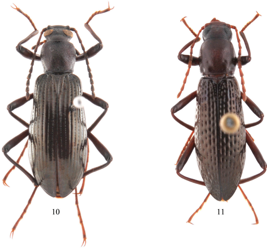
Figures 10–11. Habitus. 10 S. liangi sp. n. 11 S. claudum (Gebien, 1914).

Material examined. 1♂, Taiwan, Kaohsiung, Xiaoguanshan, 10.xii.1996, Wen-Yi Zhou leg.; 1♂, 1♀, Taiwan, Kaohsiung, Tengzhi, 1.xi.2008, Chang-Qing Chen leg.; 1♂, Taiwan, Pingtung, Erjitan, 5.iv.1997, Wen-Yi Zhou leg.; 1♀, Taiwan, Nantou, Ren'ai, qingjing, 1890 m, 7.v.1996, Wen-Yi Zhou leg.; 1♀, Taiwan, Taipei, Sanxia town, 24.v.1994, Wen-Yi Zhou leg.