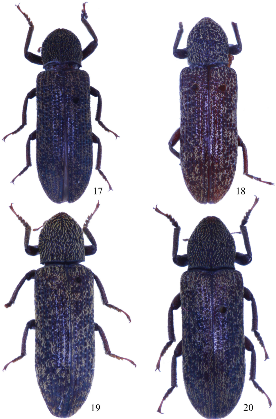
Figures 17–20. Habitus. 17 S. apiconcavus sp. n. ♂ 18–19 S. xinyicus sp. n. (18 ♂ 19 ♀) 20 S. cylindricus ♂.