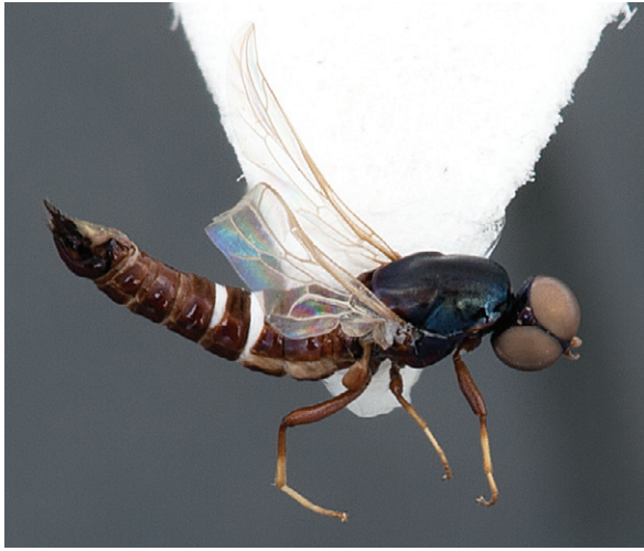
Figure 1. Prepseudotrichia tiger sp. n.: Male holotype habitus. Body length= 4.1 mm.