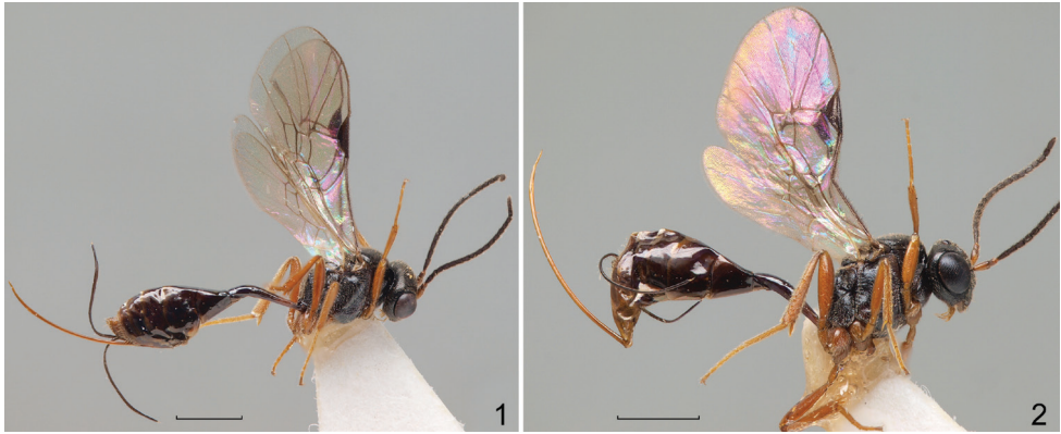
Figures 1–2. Phradis peruvianus sp. n. 1 holotype 2 paratype.

more or less distinct fine transverse wrinkles. Basal part of propodeum short, 0.25–0.27 times as long as apical area. Basal longitudinal carinae indistinct, propodeum dorsally with broad impressed area with few longitudinal wrinkles. Propodeal spiracle very small, round; distance between spiracle and pleural carina equal to about 3.0 diameters of spiracle. Apical area flat, anteriorly broadly rounded, sometimes slightly truncated.