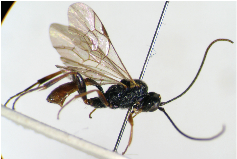
Figure 8. Syntactus minor (Holmgren, 1857). Female. Body, lateral view.

Dorsolateral carinae weak, subbasal portion near spiracle indistinct. Ventrolateral carinae complete. Spiracle convex, located slightly before middle of first tergum. Second tergum trapeziform, approximately 0.7 times as long as apical width. Third tergum approximately 0.5 times as long as apical width. Ovipositor sheath approximately 0.7 times as long as apical depth of metasoma, subapical portion distinctly wider than basal portion (Figure 6). Ovipositor very thin.