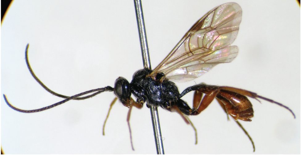
Figure 7. Syntactus delusor (Linnaeus, 1758). Female. Body, lateral view.