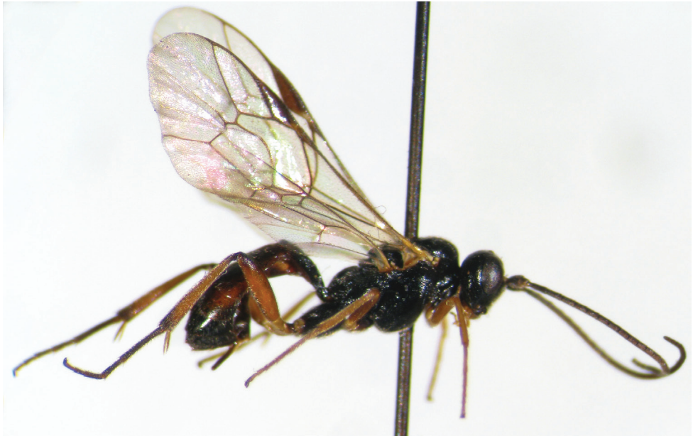
Figure 9. Syntactus varius (Holmgren, 1858). Female. Body, lateral view.

Color. (Figure 1). Main body and legs yellow, except the following. Flagellum reddish brown. Apical teeth of mandibles, vertex, collar, mesoscutum, lateral portions of scutellum and postscutellum, axillary troughs of mesonotum and metanotum, a small spot beneath subalar prominence, fourth to seventh terga except narrow hind margins black. Median portions of scutellum and postscutellum red. Propodeum darkish brown, lateral portion fuscous. Terga 1 to 3 reddish brown. Posterior-lateral portions of third and fourth terga with longitudinal brownish black spots. Metapleuron and hind legs reddish brown. Stigma blackish brown. Veins dust-colored.