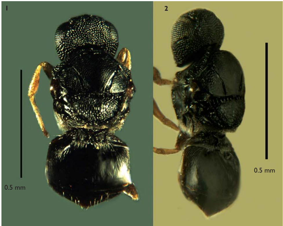
Figures 1–2. Masnerium wellsae 1 Dorsal habitus 2 Dorso-lateral habitus

diverging posteriorly. T2 with two shallow transverse setose pits anteriorly. Strongly longitudinally striate laterally. T3 – T8 setose.