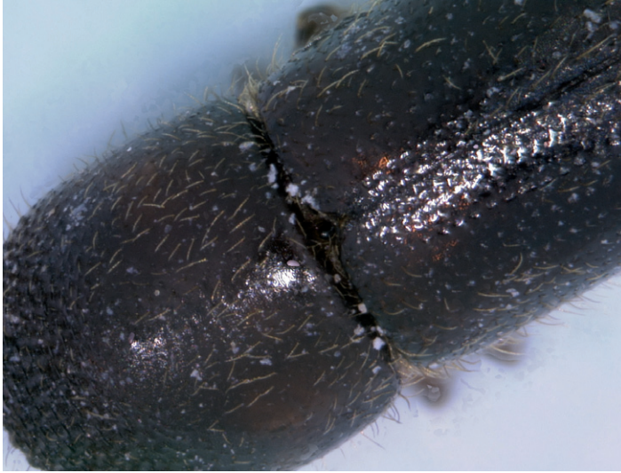
Figure 3. Scutellum of Xyleborinus octiesdentatus adult female.

yaupon whereas no specimens were collected from the other species. No specimens of X. octiesdentatus were found boring into the yaupon tree.