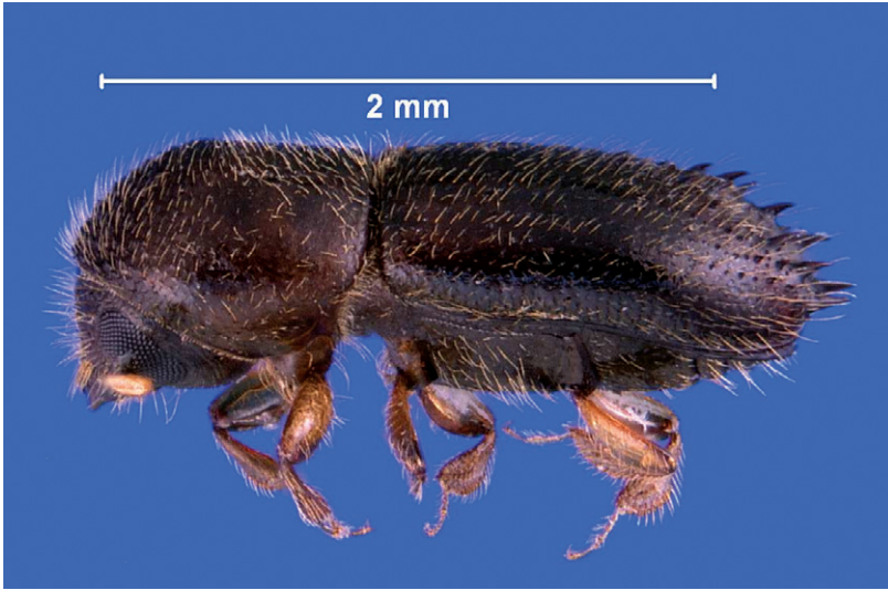
Figure 1. Lateral view of Xyleborinus octiesdentatus adult female.

Description. The species was redescribed by Nunberg (1982)