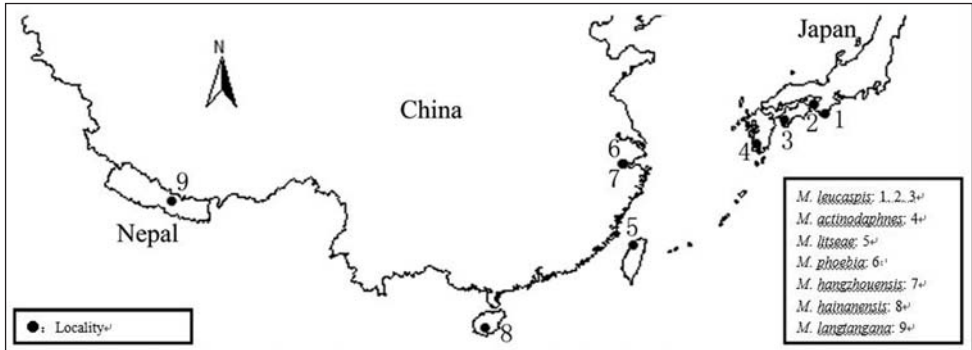
Figure 13. Distribution of Megacanthaspis .

rax and abdominal segment I-II, each with 1 microducts. Dorsal macroducts present on abdominal segments I-VIII; forming more or less segmental rows on abdominal segments I-VI, but scattered on abdominal segments VII-VIII; with a macroduct between median gland spines. Ventral macroducts 2-barred, as big as dorsal macroducts, scattered occurring on lateral body margin on prothorax, metathorax and abdominal segments I-IV. Ventral microducts present on prothorax, metathorax, segments I-IV. Anal opening about 68 \mu\text{m} long from apex. Perivulvar pores in an arc with a total of 13–25.