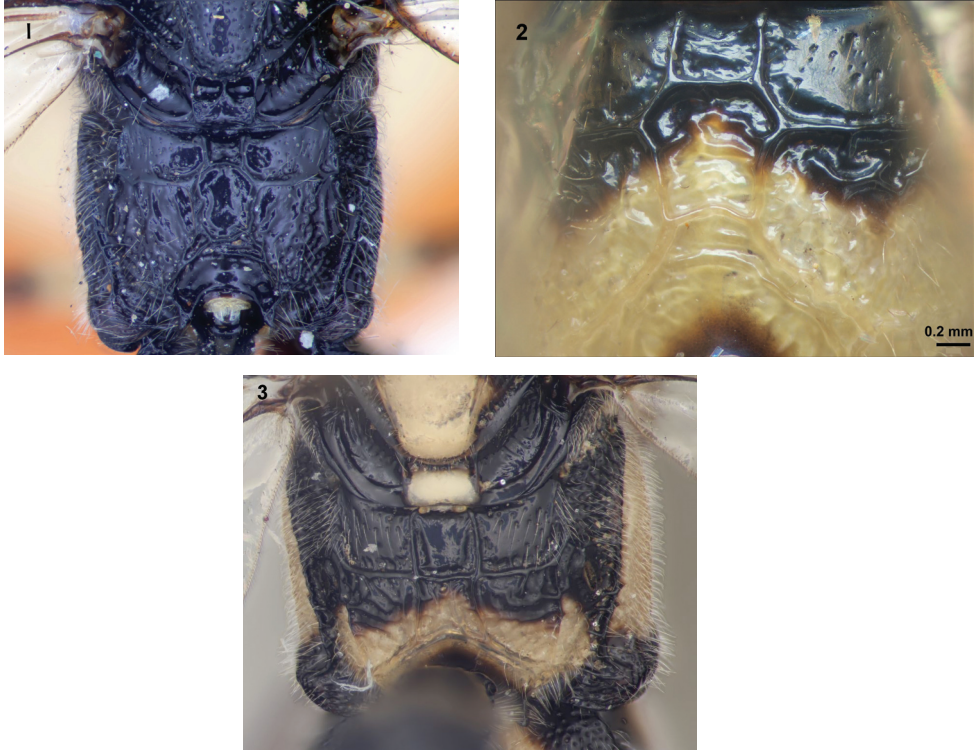
Figures 1–3. Propodeum of neotropical species of Arotes , posterodorsal view. 1. Arotes facialis , 2. Arotes ucumari sp. n., 3. Arotes pammae .