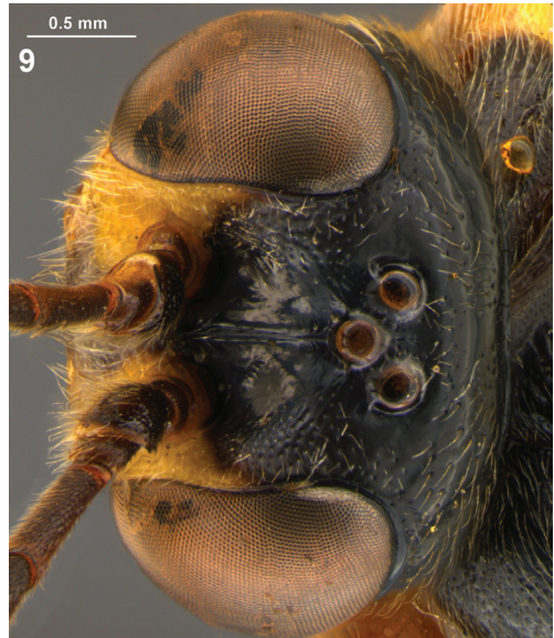
Figures 8–9. Head, dorsal view. 8. A. albicinctus , 9. A. moiwanus .

Type specimen. Holotype female, pinned. Original label: “Peru, CU, San Pedro, 13°02'58" S, 71°32'13" W, 1500 m, Malaise trap, 20.ix.2007, C. Castillo". UNSM.