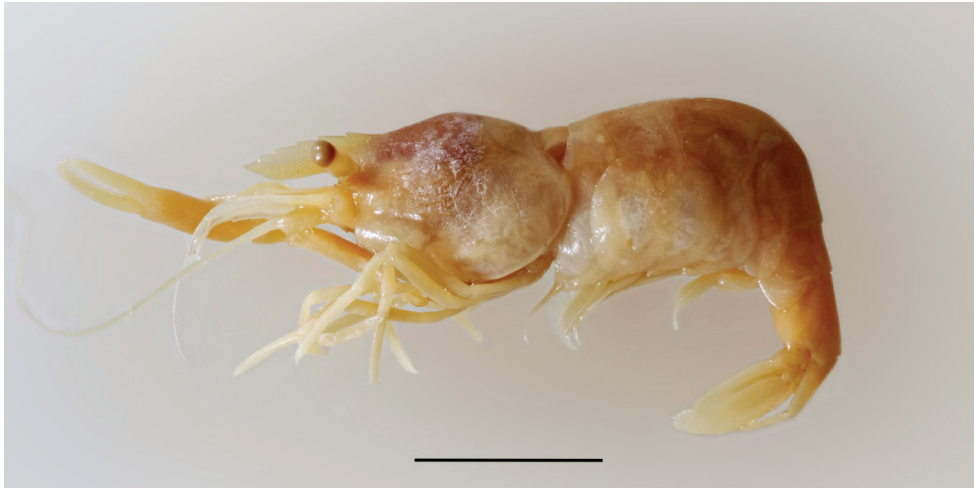
Figure 1. Holotype of Palaemonella amboinensis Zehntner, 1894, adult female, MHNG (scale bar 5 mm).

multiple spinules medioproximally and multiple pappose setae distally. Male second pleopod with appendix masculina slender, with several simple terminal and lateral setae. Uropods normal.