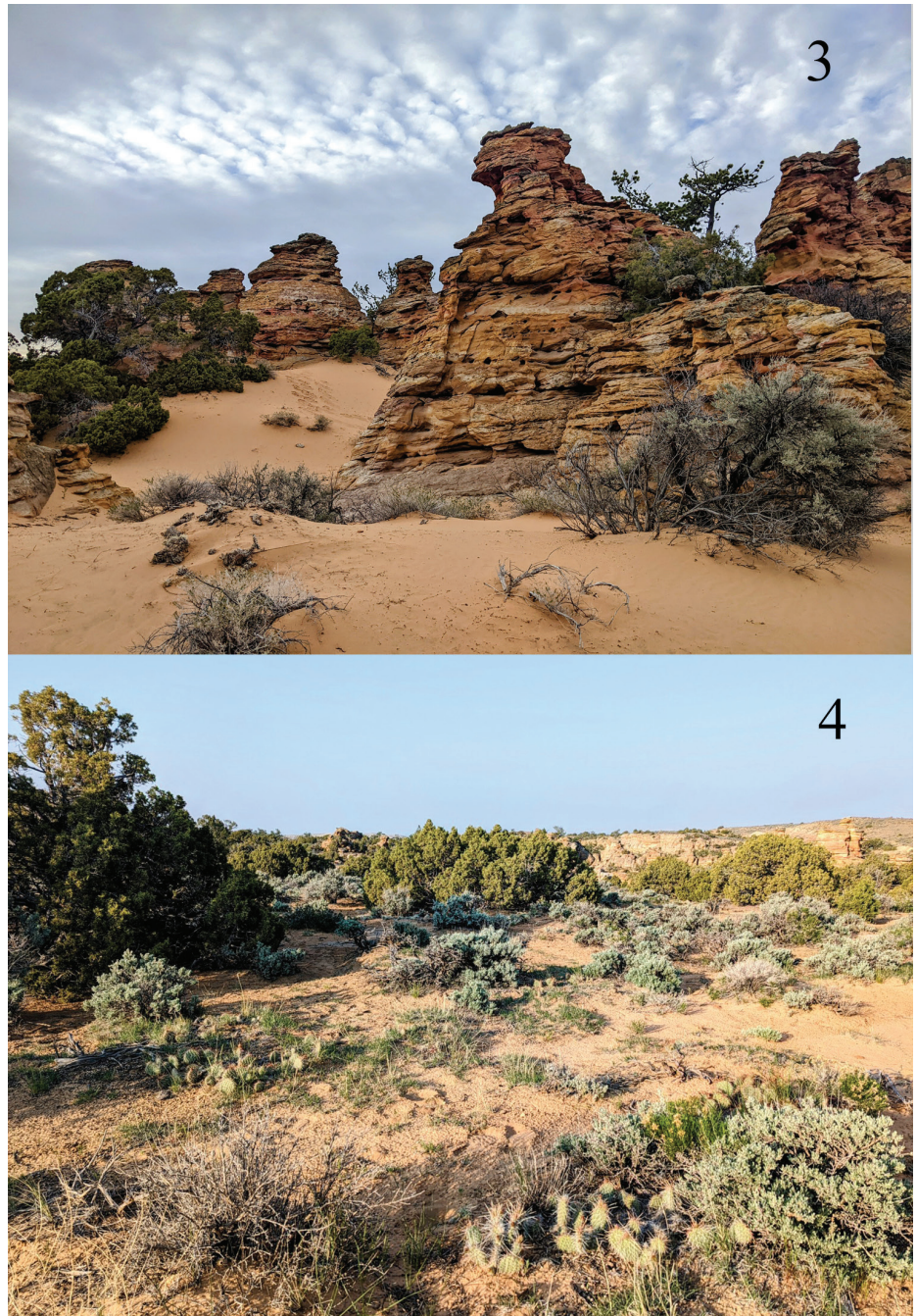
Figures 3, 4. Protogygia pryorensis habitat at Petroglyph Canyon Natural Area, Carbon County, Montana, USA 3 shows active sands and sandstone hoodoos at a canyon entry, while 4 is a nearby area of mixed soils and interspersed bedrock above the canyon rim. Sparse woody vegetation of Juniperus osteosperma , Pinus flexilis , Chrysothamnus viscidiflorus and Artemisia tridentata and mats of Opuntia polyacantha are depicted.

vapor light. All specimens were found from May 6 to May 9, with none collected May 19 or June 1, indicating a brief flight period. All six specimens from May 6, 2022 are fresh, while a few of the specimens from May 8 and 9, 2023 demonstrate slight wear. No females have been found.