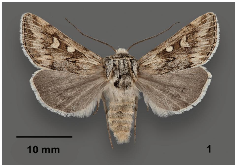
Figure 1. Protogygia pryorensis , paratype male, USA, Montana, Carbon County, Pryor Mountains, Petroglyph Canyon Natural Area.

( ibid. , pl. I figs 24–28). However, P. pryorensis lacks the defining structural characters of this group: basal swelling and truncate apex of the uncus and truncate ampulla of the clasper ( ibid. , pl. 27 figs 1, 2). We assign P. pryorensis to the album -group based on its cylindrical apically hooked uncus and teardrop-shaped clasper, both typical of the other six species in this group ( ibid. , pl. 27 figs 3–8). All other species in the album -group except P. milleri are either nearly white or streaked longitudinally ( ibid. , pl. I figs 29–42).