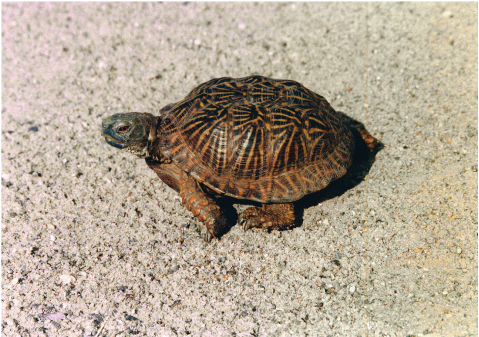
Figure 3. Terrapene ornata . Rancho de Flores Magón, Buenaventura, Chihuahua.