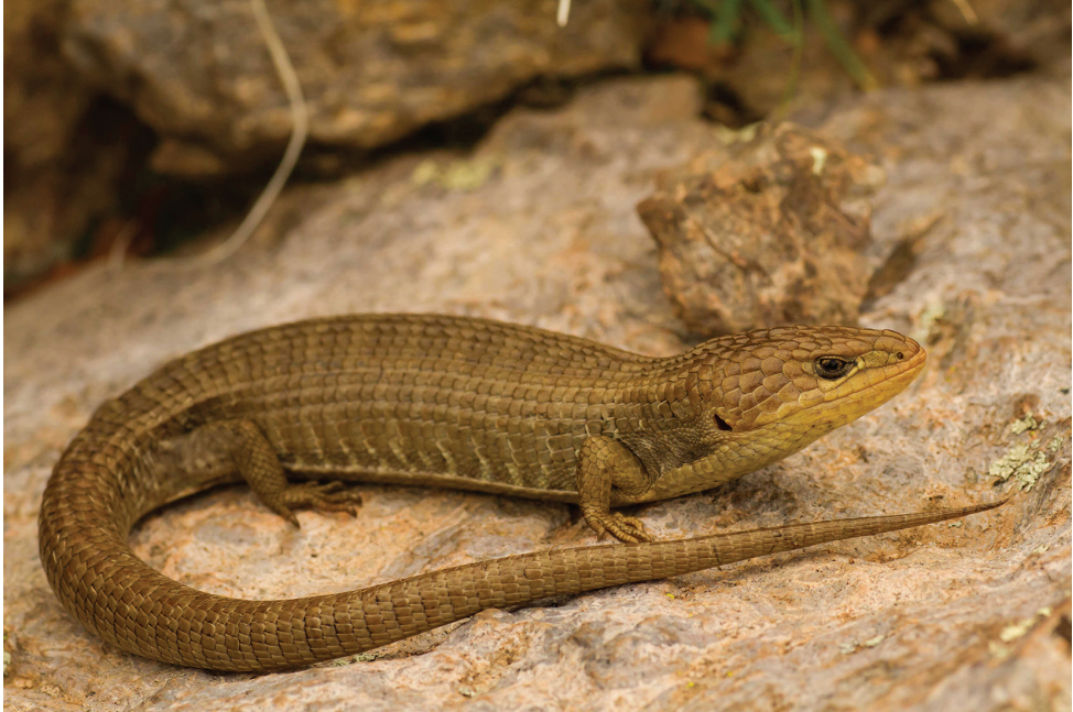
Figure 4. Barisia levicollis (female). Sierra del Nido, Chihuahua.

and Apalone spinifera ). The remaining two species of turtles are widely distributed from southern Canada to northern Mexico ( Chrysemys picta ) and from southeastern Sonora, through the Pacific Coast, to Costa Rica ( Rhinoclemmys pulcherrima ).