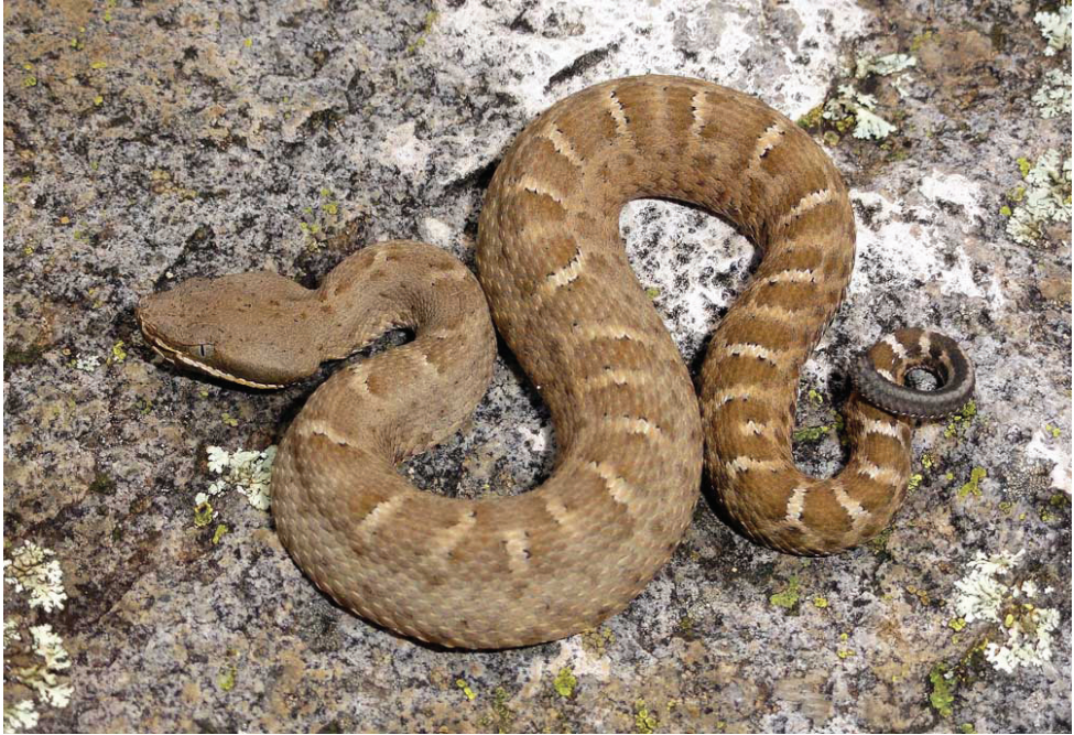
Figure 5. Crotalus willardi. Sierra del Nido, Chihuahua.

Holbrookia elegans , H. maculata , Phrynosoma cornutum , P. modestum , Sceloporus bimaculosus , S. clarkii , S. consobrinus , S. cowlesi , S. jarrovi , S. merriami , S. poinsettii , S. slevini , S. virgatus , Urosaurus ornatus , Uta stansburiana , Plestiodon callicephalus , P. multivirgatus , P. obsoletus , P. tetragrammus , Aspidoscelis exsanguis , A. gularis , A. inornata , A. marmorata , A. sonorae , A. tessellata , and A. uniparens ). Only one of the 51 lizard species that occur in Chihuahua is an introduced species ( Hemidactylus turcicus ).