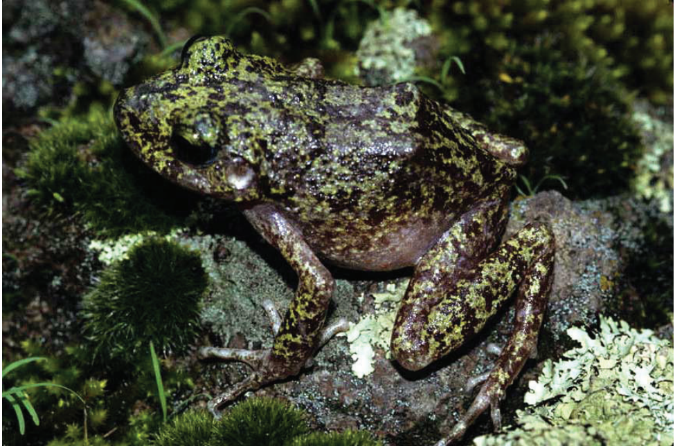
Figure 2. Craugastor tarahumaraensis . Ocampo, Chihuahua.