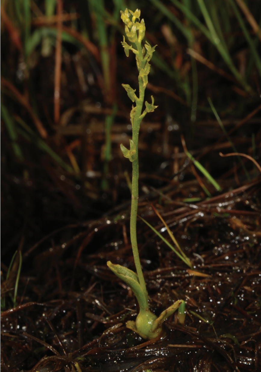
Figure 1. Hammarbya paludosa (L.) Kuntze photographed in Cinque Valli (province of Trento, Roncegno municipality) on July 19 th 2015.

tion of H. paludosa to trampling damage. For this reason exact coordinates of the site of occurrence are omitted.