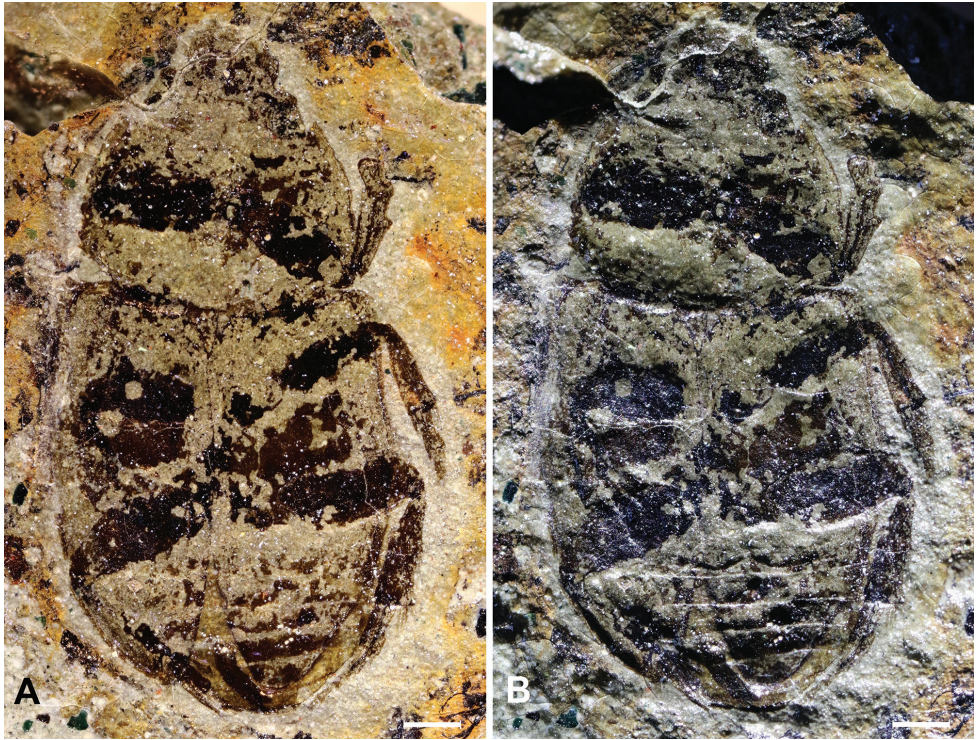
Figure 3. Ceaformotensis archratiras gen. and sp. n.: holotype BP/2/18654, general appearance. Micrographs taken under: A polarised light B low angle unpolarised light. Scale bar: 1 mm.