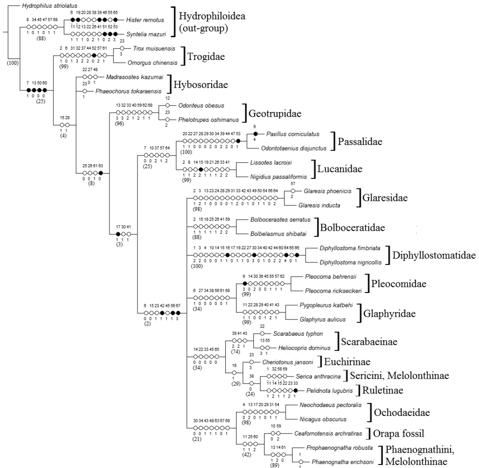
Figure 1. Strict consensus of six most parsimonious trees showing characters (above) and state (below). Bootstrap support values are given in parentheses (tree length=275 steps, ensemble consistency index (CI) = 0.39, ensemble retention index (RI) = 0.64). C. archratiras is referred to as “Orapa fossil”. Character set from Bai et al. (2011).

molecular-based phylogenies (Ahrens et al. 2014; Smith et al. 2006), was not apparent in the strict consensus tree and may suggest that the placement of Ochodaecidae as a sister taxa to the Phaenognathini is erroneous. The Phaenognathini, recently established by Ocampo and Mondaca (2012), contains the genera Phaenognatha Hope, 1845 and Neophaenognatha Allsopp, 1983 formerly placed within the Aclopiniae. The position of the Phaenognathini within the Melolonthinae remains unclear although Ocampo and Mondaca (2012) have hypothesised a relationship between the Phaenognathini and the Lichniini suggesting that they may “constitute a distinct and ancient lineage of Scarabaeidae”. Evidence from a preliminary molecular analysis (Smith et al. 2006)