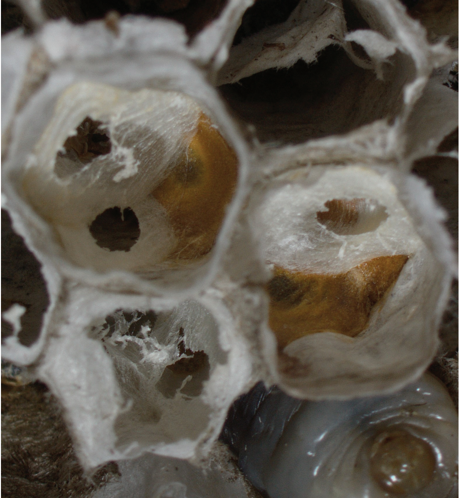
Figure 1. White Sphecophaga vesparum cocoons from which the parasitoid has emerged, and closed yellow cocoons in a nest of Dolichovespula media . A host cell may have both white and yellow cocoons.

females and possibly males; and 3) resistant yellow, overwintering cocoons (Donovan 1991). I classified the cocoons as white or yellow because I was not confident in separating the two types of yellow cocoons, except in one nest. Aphomia sociella larvae were counted or the past presence of the species was determined by the silk spun by the larvae.