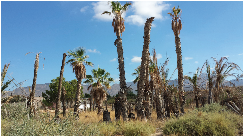
Figure 2. Partial view (16 July 2016) of an abandoned date palm grove (Agost, Alicante, Spain) where Crematogaster inermis , Trichomyrmex destructor and T. mayri had been temporary nesting in July 2007.

2007: irrigated grove; 2016–2017: abandoned grove, without irrigation. In bold, exotic ant species in Spain.