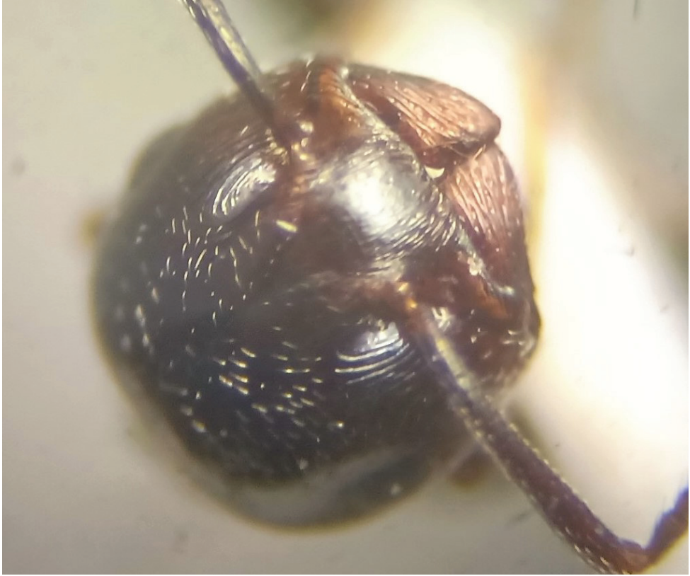
Figure 4. Crematogaster inermis . Worker head in frontal view, with abraded mandible denticles. (HW 1.125 mm).

Colour deep brown to black. Head slightly wider than long (CI 108), with compound eyes projecting beyond lateral margins in full face view; mandibles longitudinally striate; clypeus not emarginated anteriorly, with rugulose middle area and striated laterals; 6–8 long setae on the anterior clypeal border, directed anteriorly and 1–3 pairs of setae in the central area of clypeus; short, subdecumbent to appressed pubescence all over the cephalic surface, which is mostly glassy smooth, except for longitudinal striae at genae and semicircular striae at the base of antennal insertions; one pair of setae at the level of antennal insertion, and 0–2 pairs on the frontal area; 11 segmented antennae, with a three-segmented club; scape with short decumbent or appressed setae; distal part of scape just reaching the vertex (SI 42). Gula with 2–8 curved anteriorly setae. Occipital carina present.