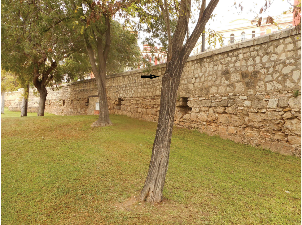
Figure 1. Robinia pseudoacacia tree (black locust) where Crematogaster inermis were nesting (Valencia, Spain). Black arrow indicates the level of nest entrance (Image X. Espadaler).

We measured the first two collected workers plus four of the smallest, four medium and four biggest workers, thus totalling 14 workers. Measurements were made at 60× with a dissecting microscope and are shown as the mean (minimum, maximum) in mm.