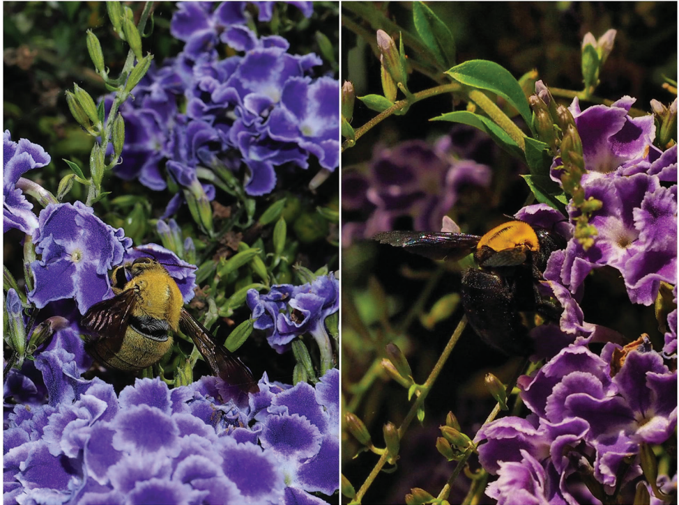
Figure 1. Pictures of Xylocopa pubescens (male left; female right) in the Parque de La Ballena (Las Palmas de Gran Canaria).

(Greece; Terzo and Rasmont 2014) and the Iberian Peninsula (South Spain; Ortiz and Pauly 2016). In Gran Canaria, all the new records are restricted to the North in Las Palmas de Gran Canaria city, in the surroundings of the port and large urban gardens; additionally, there is one record from the southern tip of Gran Canaria in La Playa del Inglés (Fig. 2). A social network member reported a previous sighting in 2019 in the area where the current sightings occurred, which suggests that the species has been on the island for at least one year.