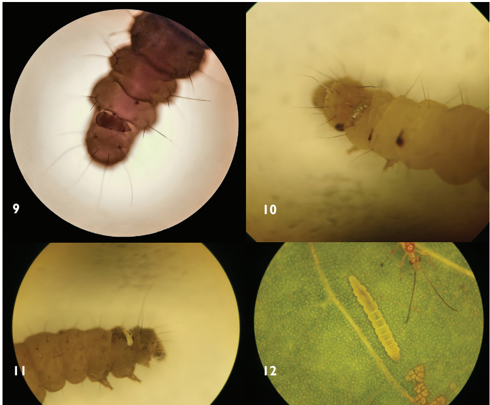
Figures 9–12. Pseudavga flavicoxa with final instar larval host Bucculatrix thoracella . 9–11 egg on intersegmental membrane behind prothorax of host 12 adult female parasitoid ignoring host.

fluid that appeared in the tube, and three adults suffering this fate were dissected (8, 9 and 12 days after 10.x.2014, when they had started to feed on dilute honey). The dissections hardly differed, each showing a single egg nearing maturity in each of the two ovarioles of the paired ovaries (i.e. 4 eggs in advanced ovigenesis, Figure 13), but with little sign that other eggs would follow. No egg had entered the oviduct per se, and it was unclear whether they were ready for oviposition or, conceivably, being resorbed. It does, however, seem certain that if eggs were going to be ready for oviposition from these females in October 2014, the period from 10.x.14 to (maximally) 25.x.2014, during which they had been warm, fed ad libitum, and given access to hosts, was long enough for them to have become so. Thus it was surprising that no ovipositions were obtained, especially as the adult female parasitoids showed no sign of behaviour suggesting that they might overwinter as adults (it has not, however, escaped notice that none of the adults of Pseudavga seen has unequivocally overwintered in a host cocoon).