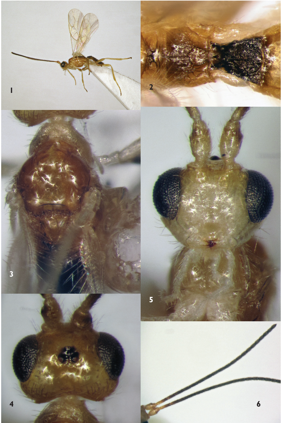
Figures 1–6. Pseudavga flavicoxa , female. 1 habitus, lateral 2 propodeum and 1 st metasomal tergite, dorsal 3 mesosoma, dorsal 4 head, dorsal 5 face 6 antennae.