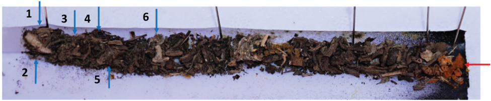
Figure 2. Dipogon variegatus nest. The blue arrows indicate the location of the six cocoons, partially hidden by the debris. The red arrow indicates the fragments of the orange-coloured Osmia cornuta provision.