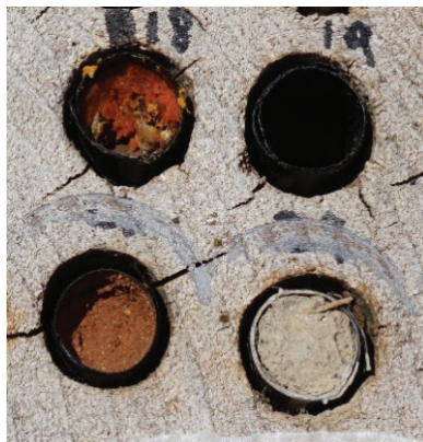
Figure 1. Plug of Dipogon variegatus nest (top left) plastered with pieces of orange-coloured pollen-nectar provision stolen from an Osmia cornuta nest. The two mud plugs at the bottom are O. cornuta nests.

Cocoons were 0.8–1 cm long and 2–3 mm wide and had two distinct layers. The inner layer consisted of a non-translucent whitish matrix with a shiny inner surface. The outer layer was a mesh of silk strands with debris attached to them (Fig. 3). We placed the cocoons individually in small plastic containers and kept them outdoors in a shaded area. Four adults emerged over a period of 4 days (a male from cocoon 5 on the