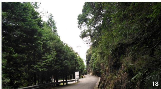
Figures 17–18. Collecting sites of Strongylogaster spp. in Zhejiang Province, China: (17) a site near Chanyuan Temple in Mt. Tianmu, Lin’an District, Hangzhou City; (18) a site near Datianping in Mt. Fengyang, Longquan City.