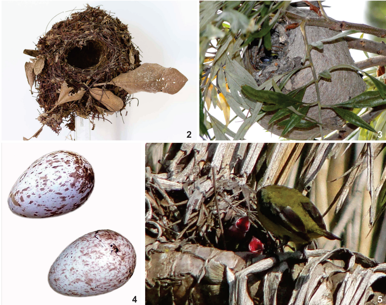
Figures 2–5. Nest, eggs and nestlings of the Purple-throated Euphonia. (2) A typical nest, globular with a lateral entrance, made of dry vegetal material kept together with spider web silk. (3) Partial view of the head of a female sitting in the incubatory chamber of an atypical nest constructed inside a vespiary. (4) Eggs are typically pyriform, with brownish marks that may be more or less concentrated around the large pole. (5) Older nestlings beg for food at nest entrance, showing their red mouth lining and white oral flanges to their mother.

Nests were globular, but sometimes laterally flattened to adapt to the supporting branches. Nest wall was composed mainly of tiny dry leaves and leaflets, fine petioles, and plumed seeds, all highly compacted with a great amount of spider web silk. Pine needles and a few small stripes of dry grass were also found in some nests. Large dry leaves could be present, and all nests were dark brown externally (Fig. 2). The incubatory chamber was lined with very thin, light brown vegetal fibers, including peduncles of grass inflorescences, palm fibers, plumed seeds, and in one case, a few small feathers. The lateral entrance was well delimited by flexible fibers placed around it, and although the entrance was round in the beginning, it became elliptical in late nesting stages,