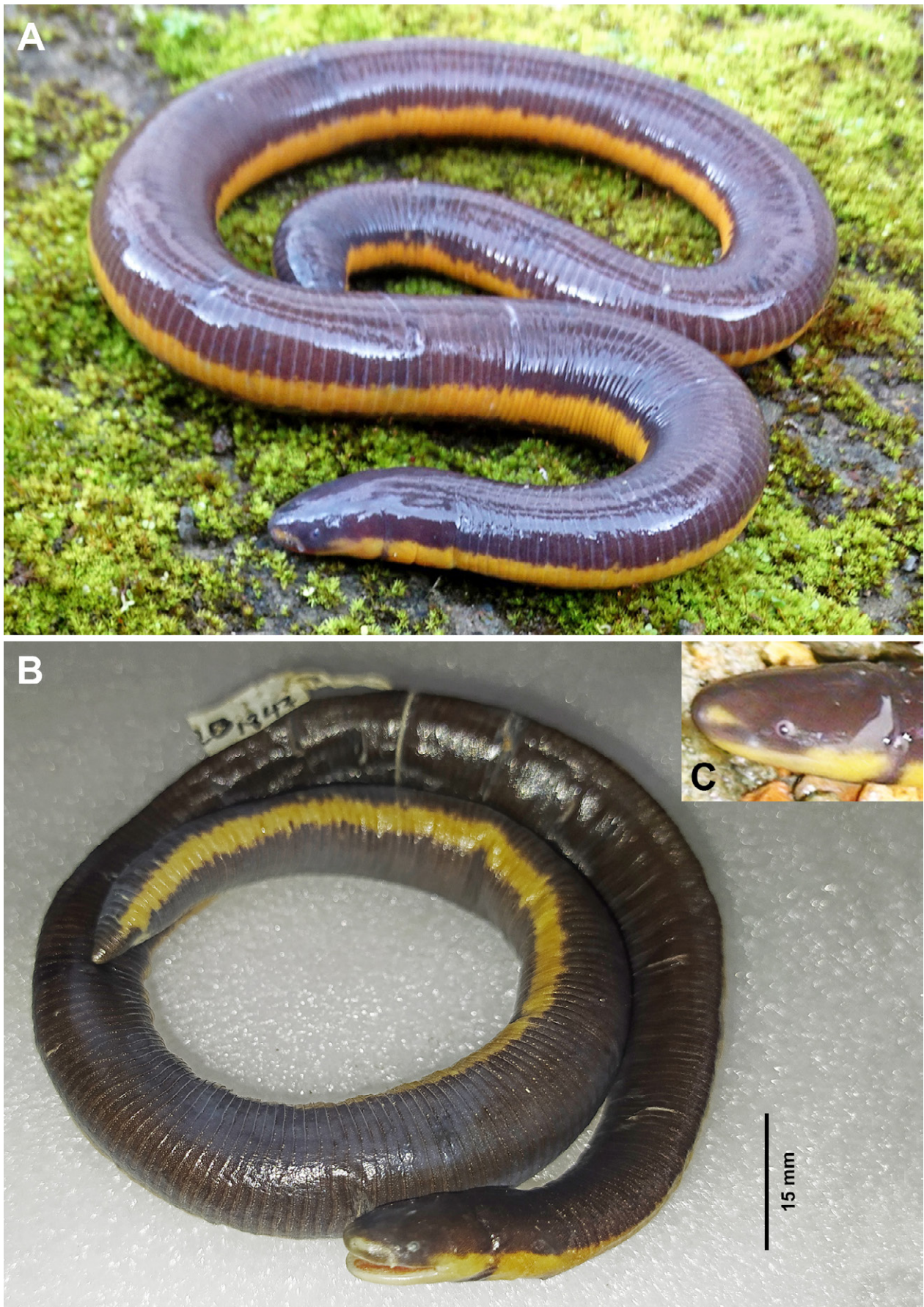
Figure 3. Ichthyophis moustakius . A. MZMU 1847 in life. B. MZMU 1847 in preservation. C. Dorsolateral view of the head of MZMU 1758 with the characteristic moustache-like, arched, yellow stripe between tentacular aperture and nostril.