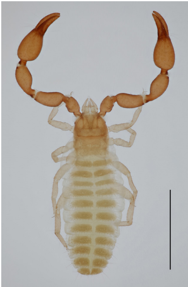
Figure 2. Lamprochernes savignyi . Female, dorsal view. Scale bar: 1 mm.

all with acuminate setae: I 13–15, II 15–17, III 18–19, IV 33–34. Chelicerae: 2.22 × longer than broad; small, slightly sclerotized; five setae (anomaly on the right chelicera, hand with six setae) and two lyrifissures on hand; moveable finger with slender well-developed galea, main stalk with five terminal rami; rallum consisting of three blades; serrula exterior with 17 blades; small, largely unsclerotized teeth situated on both moveable and fixed