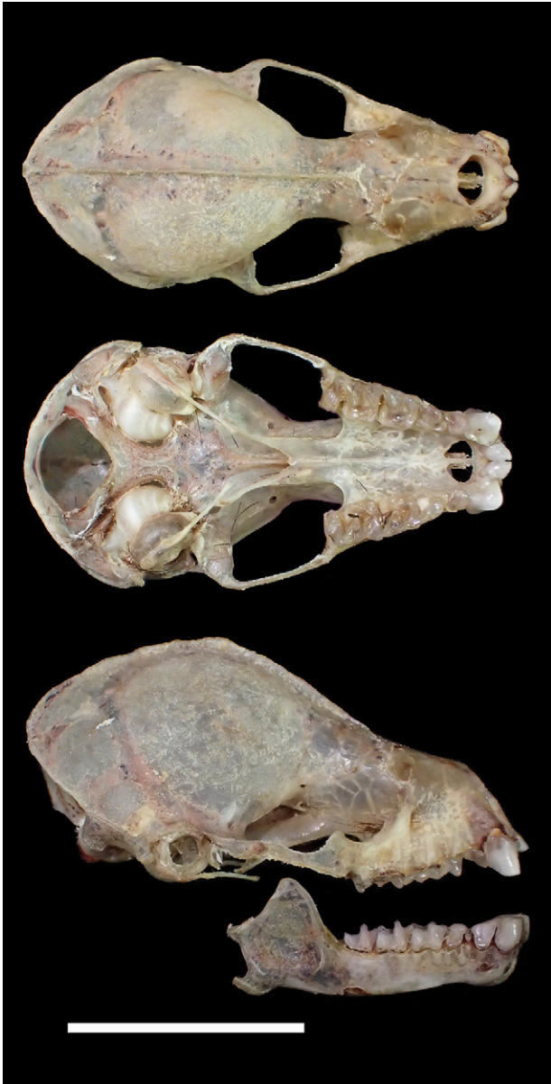
Figure 3. Dorsal, ventral, and lateral views of skull and lateral view of mandible of Lophostoma brasiliense (LMUSP 512) from Caiuá, São Paulo, Brazil. Scale bar = 10 mm.

Lophostoma brasiliense may be confused with big-eared bats (genus Micronycteris Gray, 1866), from which it can be distinguished by having two lower incisors (four in Micronycteris ), a well-developed sagittal crest, round warts on the chin (V-shaped pads in Micronycteris ), free ears (ears connected by a band of skin in Micronycteris ), and a more robust external appearance (Albuja 1999; York et al. 2019). Species of Lophostoma may be externally similar to species of Tonatia Gray, 1827, and some large members of the former genus may show overlap in forearm length with species of Tonatia . However, L. brasiliense is much smaller than known species of Tonatia , which have a forearm measuring between 51 and 62 mm (Williams and Genoways, 2008). Behaviorally, species of Lophostoma show a typical “ear curling” behavior (Fig. 2) which is absent in species of both Tonatia and Micronycteris (Williams and Genoways 2008).