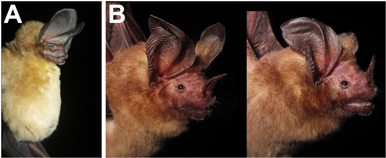
Figure 2. Lophostoma brasiliense A. Adult female (individual was released) from RPPN Foz do Aguapeí (São Paulo, Brazil); B. Adult male (LMUSP 512) from Caiuá (São Paulo, Brazil) showing the “ear curling” behavior typical of the genus.