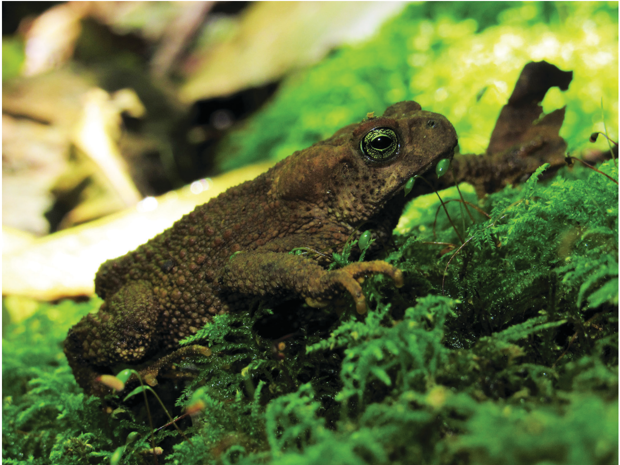
Figure 1. Rhinella rumbolli juvenile, MHNC-A 2771/PMM-100, collected at San Lorencito, Méndez province, Tarija Department, Bolivia, in the Boliviano Tucumano ecoregion.

Identification. Based on the description by Carrizo (1992), the two individuals were identified as R. rumbolli by the presence of a well-developed supraorbital crest and supratympanic crest, a sharp preorbital crest, a very prominent, ovoid paratoid gland, a small tympanum, medium-length fingers and toes with the first finger slightly shorter than the second, a more conspicuous dorsolateral chain from paratoid to groin, glands on the