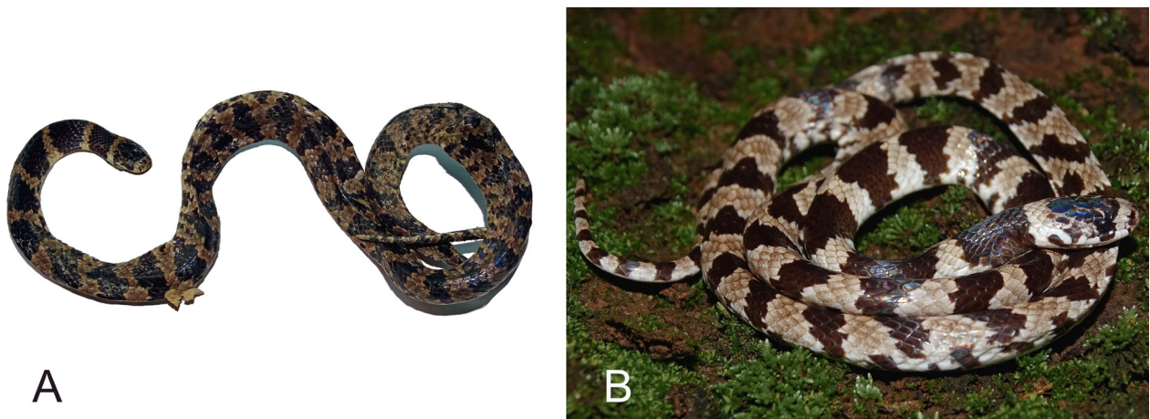
Figure 1. Road-killed adult female Dipsas mikanii from Espírito Santo state, Brazil. A. Água Doce do Norte (MBML 4472). B. Colatina (MBML 4633).

Prior to the present study, the easternmost recorded locality of Dipsas mikanii in southeastern Brazil (MCNR 2471) was in the municipality of Itueta (19.4167°S, 041.10416° W), in Minas Gerais (Nogueira et al. 2019). In addition to confirming the occurrence of this species in Espírito Santo, our new records extend this species' known distribution in the Atlantic Forest of southeastern Brazil by approximately 90 km to the northeast of Itueta