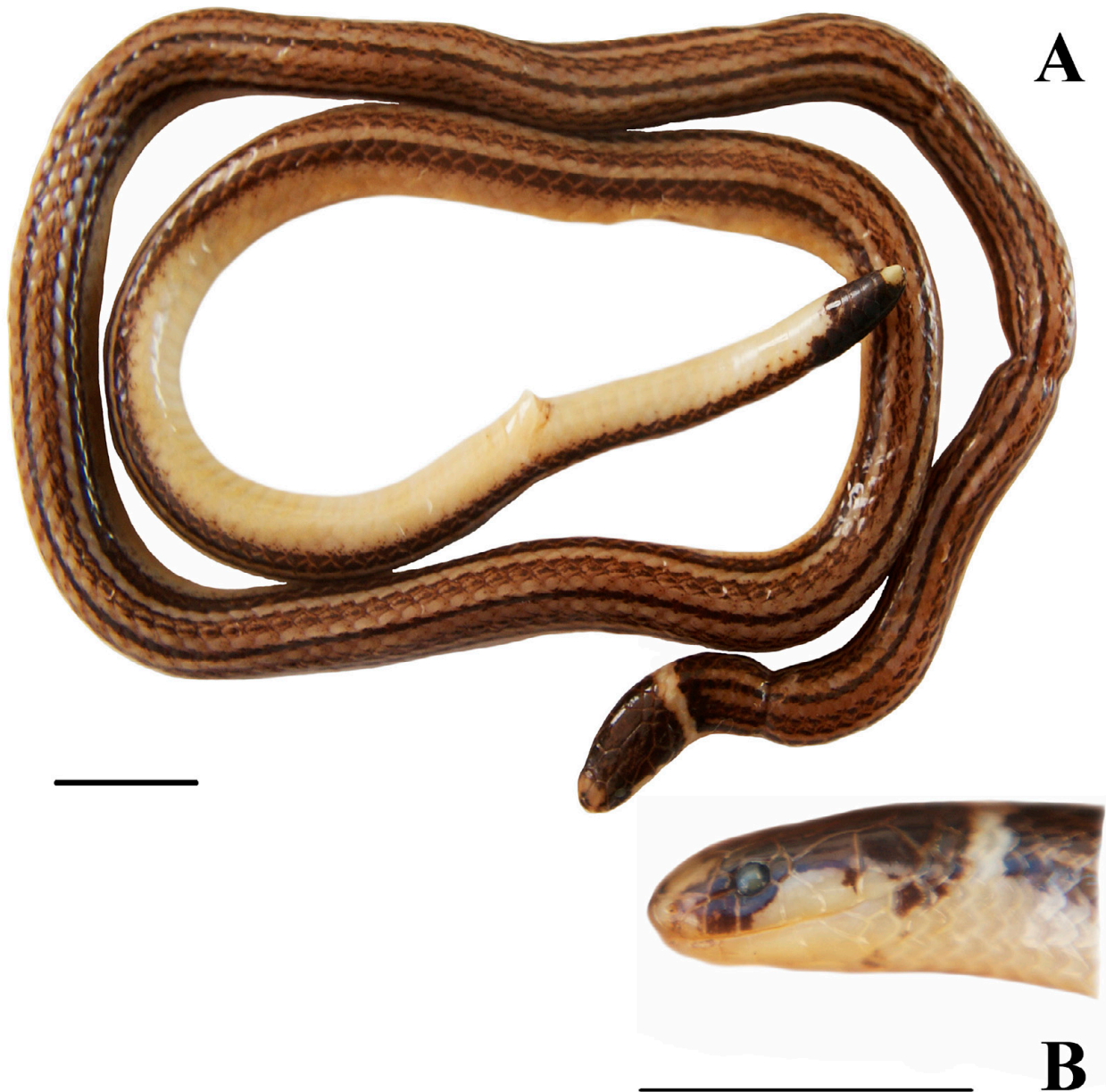
Figure 2. Adult female of Apostolepis kikoi (MZT 0011) recorded in São José dos Quatro Marcos municipality, state of Mato Grosso. Color in alcohol. A. Dorsal view. B. Lateral view of the head. Scale bars: 1 cm.

Cabaçal river basin; 15.3775°S, 058.0763°W; 173 m a.s.l.; 30 July 2003; Dionei José da Silva and Manoel dos Santos-Filho leg.; collected 100 m from the edge of a forest fragment of 46 ha; MZT 0011. • 1 adult ♂; Mato Grosso state, Araputanga municipality, Cabaçal river basin; 15.2766°S, 058.5344°W; 370 m a.s.l.; 22 Aug. 2004; Dionei José da Silva and Manoel dos Santos-Filho leg.; collected in the edge of a forest fragment of 71 ha; MZT 0052. • 1 adult ♂; Mato Grosso state, Araputanga municipality, Jauru river basin; 15.3311°S, 058.5105°W; 349 m a.s.l.; 02 Aug. 2004; Dionei José da Silva and Manoel dos Santos-Filho leg.; collected near the center of a forest fragment of 79 ha; MZT 0058.