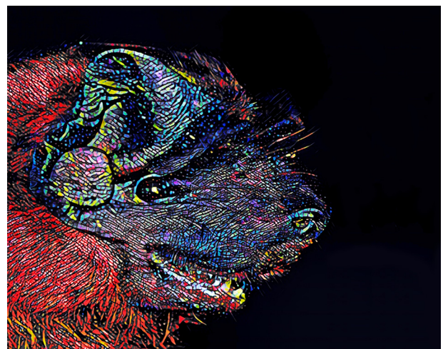
Figure 3. Big Crested Mastiff Bat, Promops centralis (Thomas, 1915), artistic representation. Illustration by H. Morales.

AL-S coordinated and obtained financial support and logistics of the fieldwork, and wrote the manuscript.